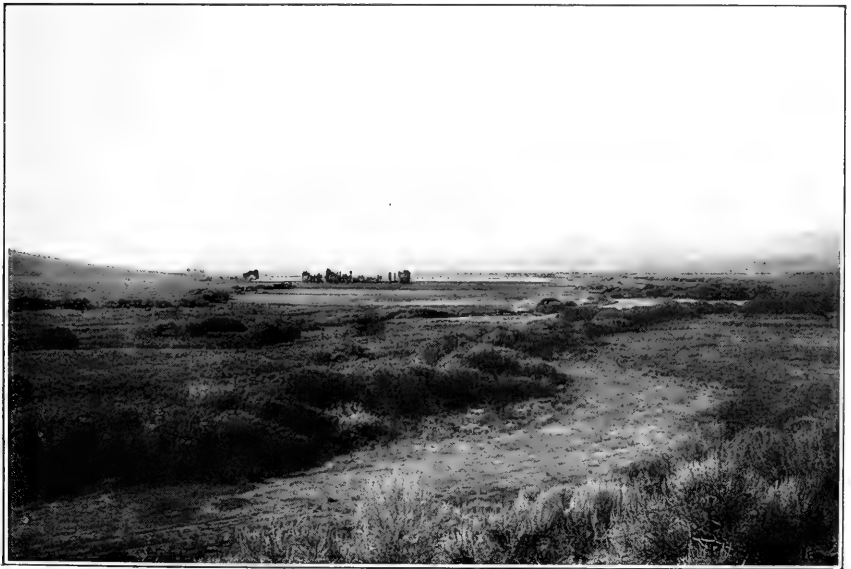
FIG. 2.—AN UNIMPROVED VALLEY SIMILAR TO THAT SHOWN IN FIGURE 1. IMPROVED AND UNIMPROVED NATIVE MEADOWS IN NORTHEASTERN CALIFORNIA.