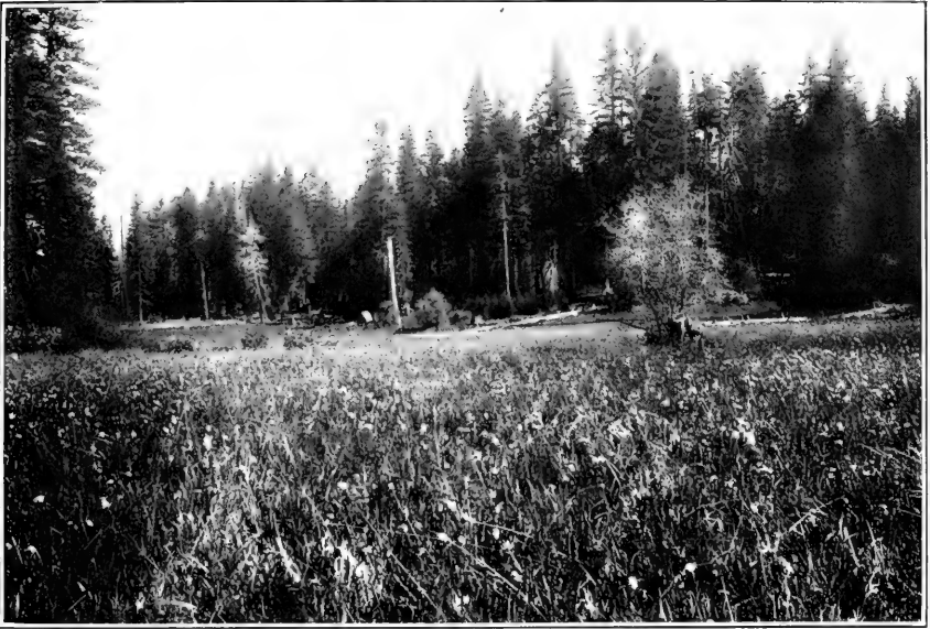
FIG. 1.—A SEDGY, WEEDY MOUNTAIN MEADOW WHERE TIMOTHY AND REDTOP WILL SUCCEED.