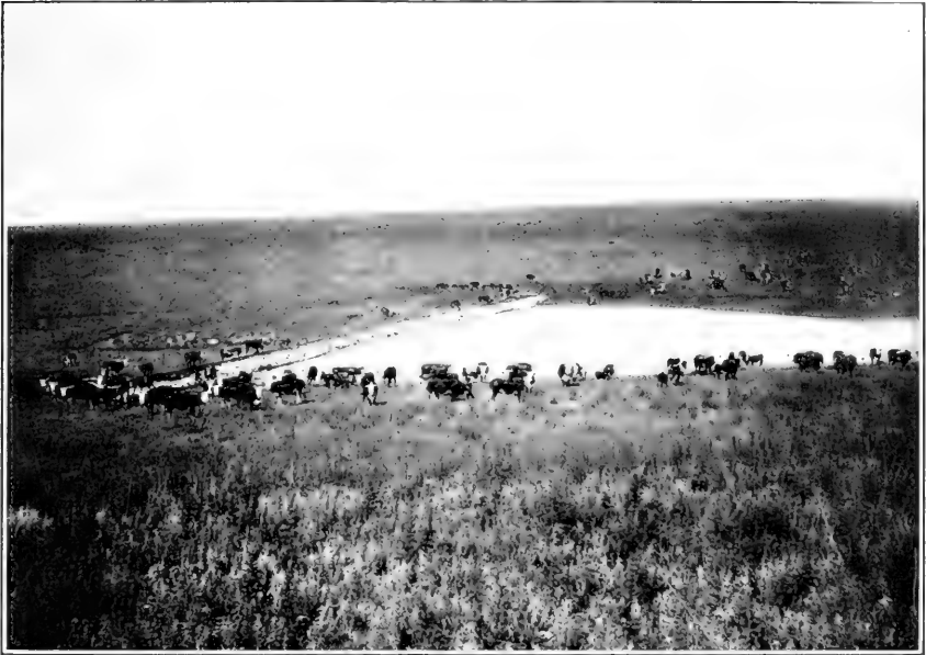
FIG. 1.—A NATIVE PASTURE IN CENTRAL KANSAS WHERE KENTUCKY BLUEGRASS IS GRADUALLY TAKING POSSESSION.