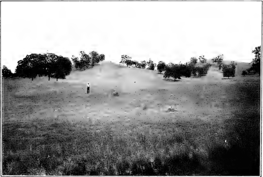
FIG. 2.—FOOTHILLS WHERE INTRODUCED BROME-GRASSES HAVE TAKEN POSSESSION. CENTRAL CALIFORNIA RANGES.