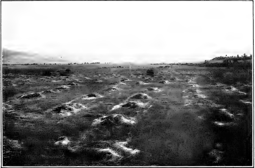
FIG. 1.—TIMOTHY AND REDTOP ESTABLISHED WITHOUT CULTIVATION.