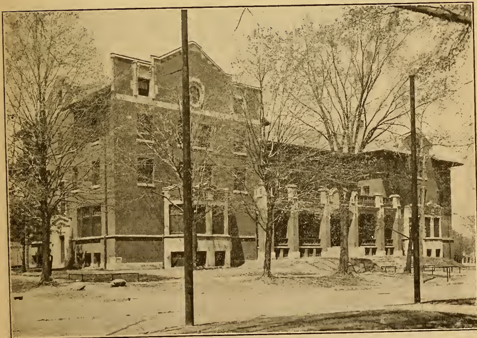
BARRACKS FOR THE AVIATORS—Y. M. C. A. BUILDING