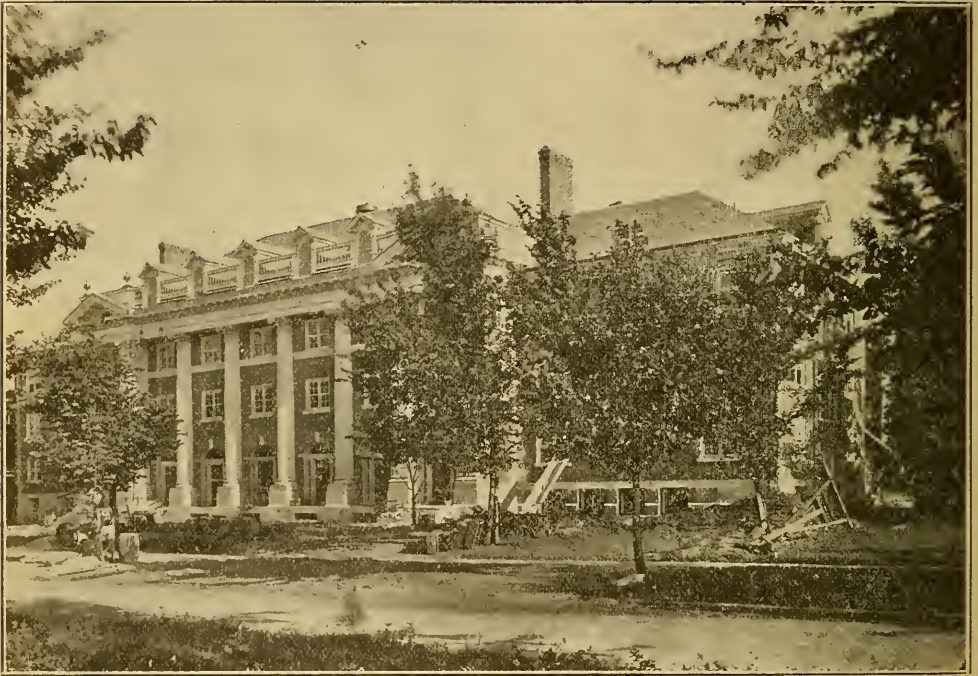
NEW WOMAN'S RESIDENCE HALL Turned for the use of the Aviators