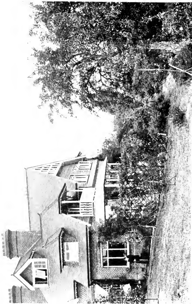
Dr. Russel Wallace's Home at Broadstone, Dorset