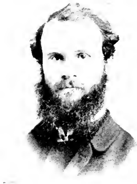
The Bishop of the Rockies