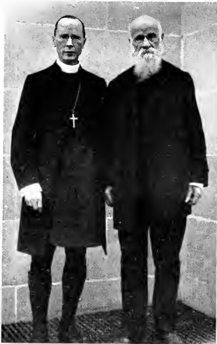
“East and West”