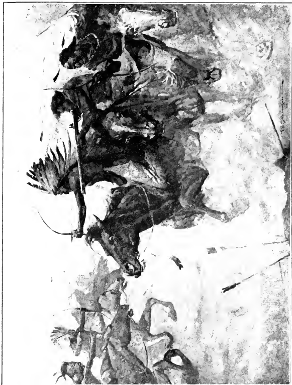
AS THEY SWEEP PAST US THEY SHOT THEIR ARROWS