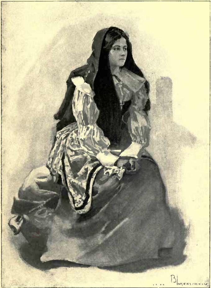
“Sitting on a bundle was a girl . . . perhaps eighteen or nineteen years old.”