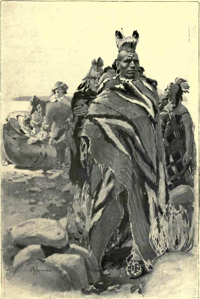
"The Indians walked silently to the fire."