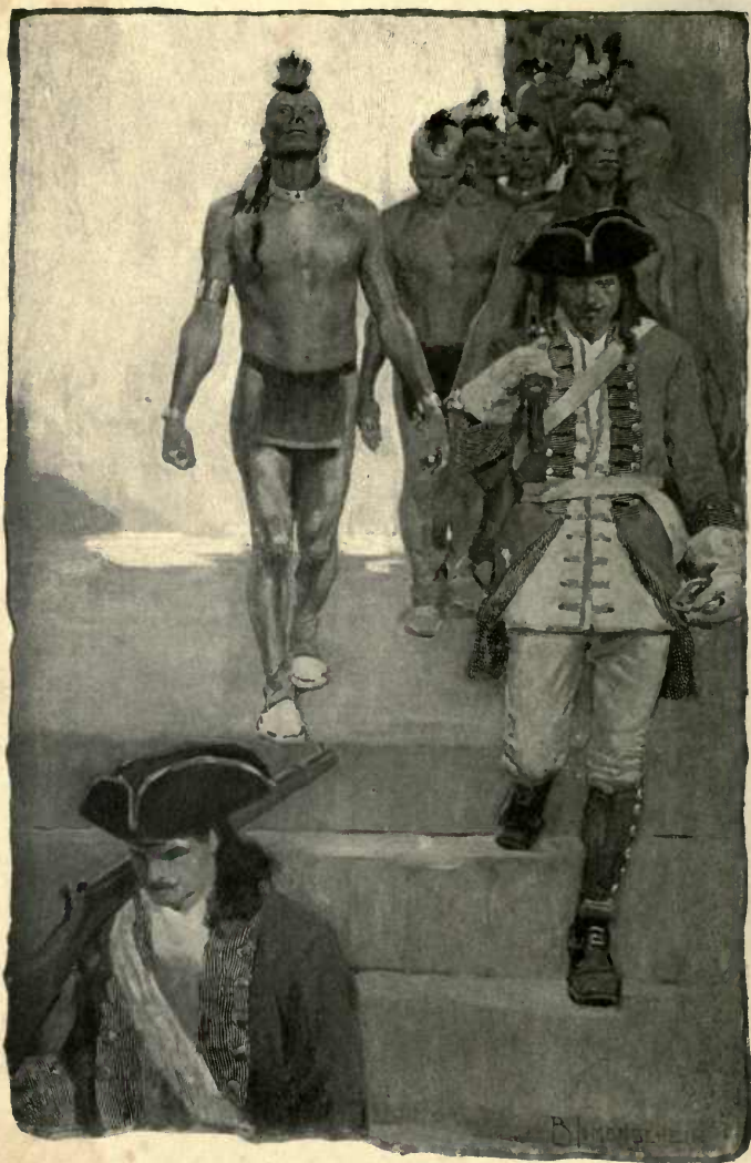
“Half way down the steps was a double file of Indians chained two and two.”