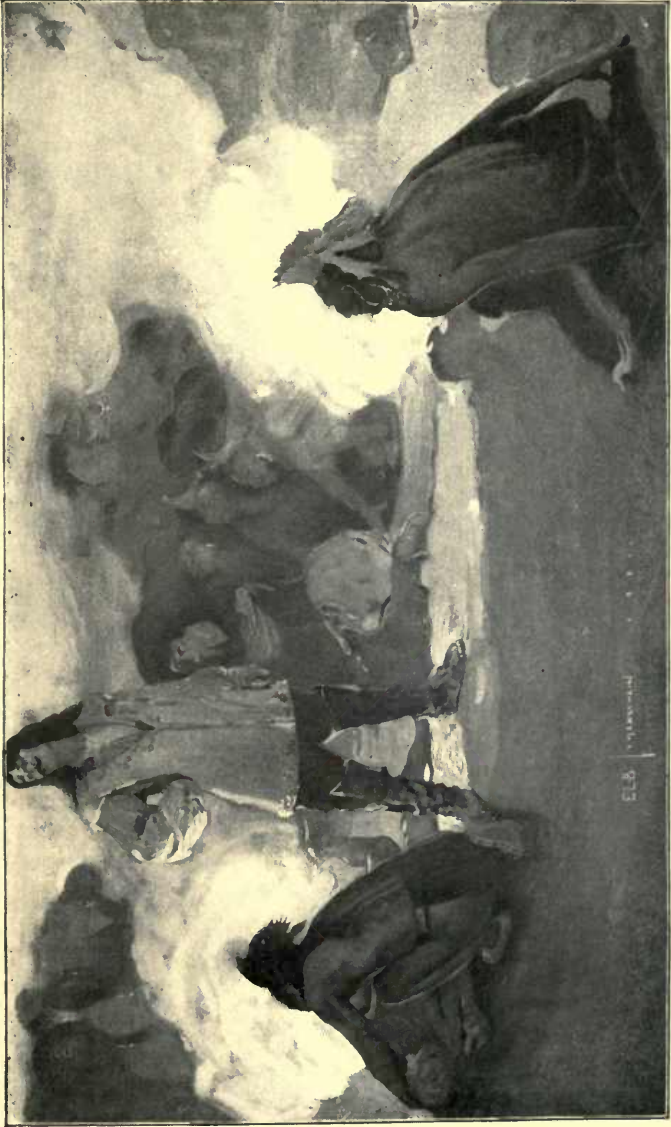
"Menard stood . . . smiling with the same look of scorn he had worn . . . when they led him to the torture."