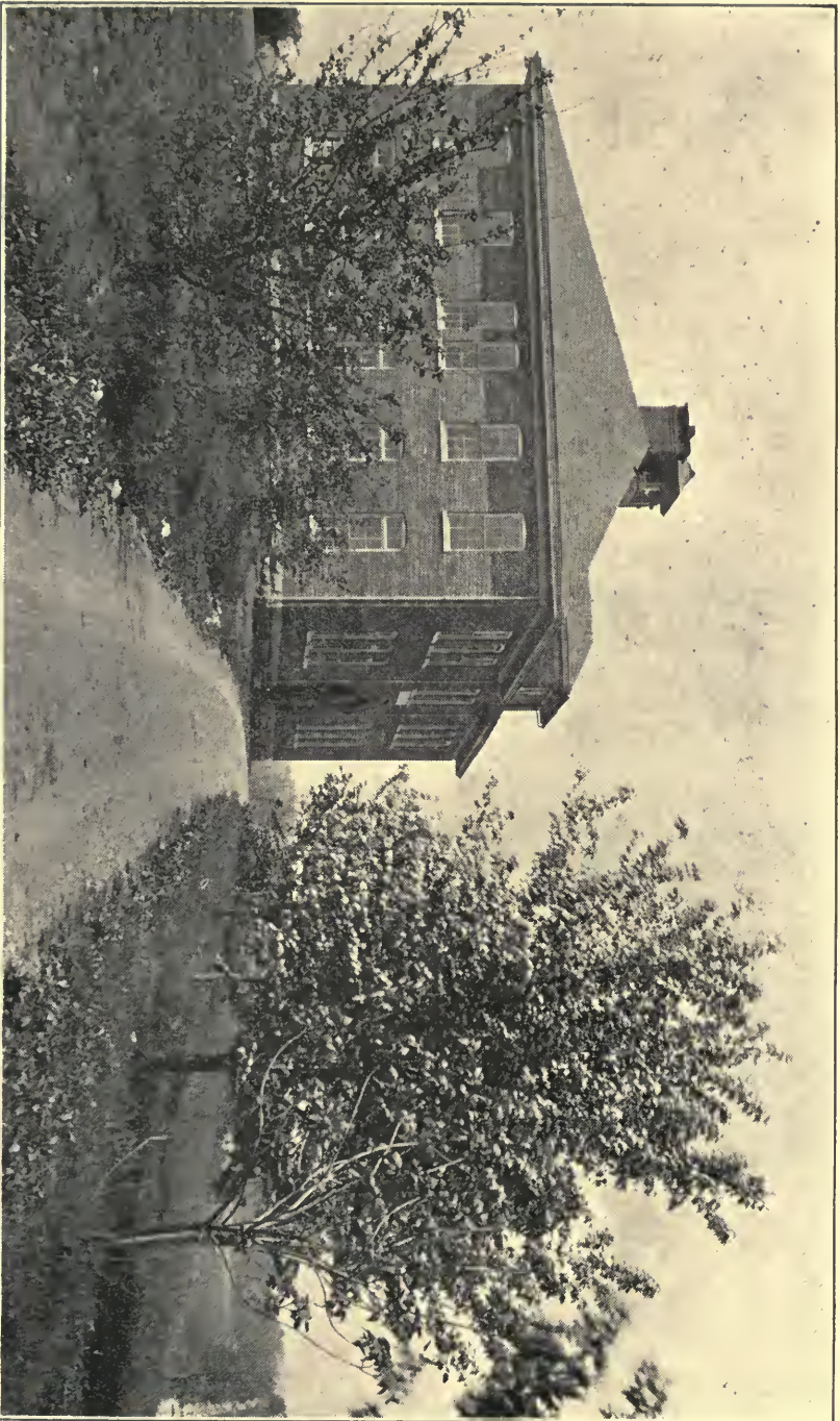
FARRAGUT HIGH SCHOOL, CAMPBELL STATION, KNOX COUNTY, TENNESSEE