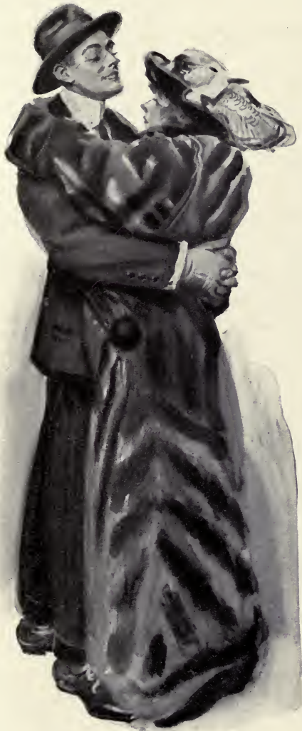
JAMES MONTGOMERY FLAGG

“Welcome home!” she cried. “Sketch in the furniture to suit yourself”—Page 288