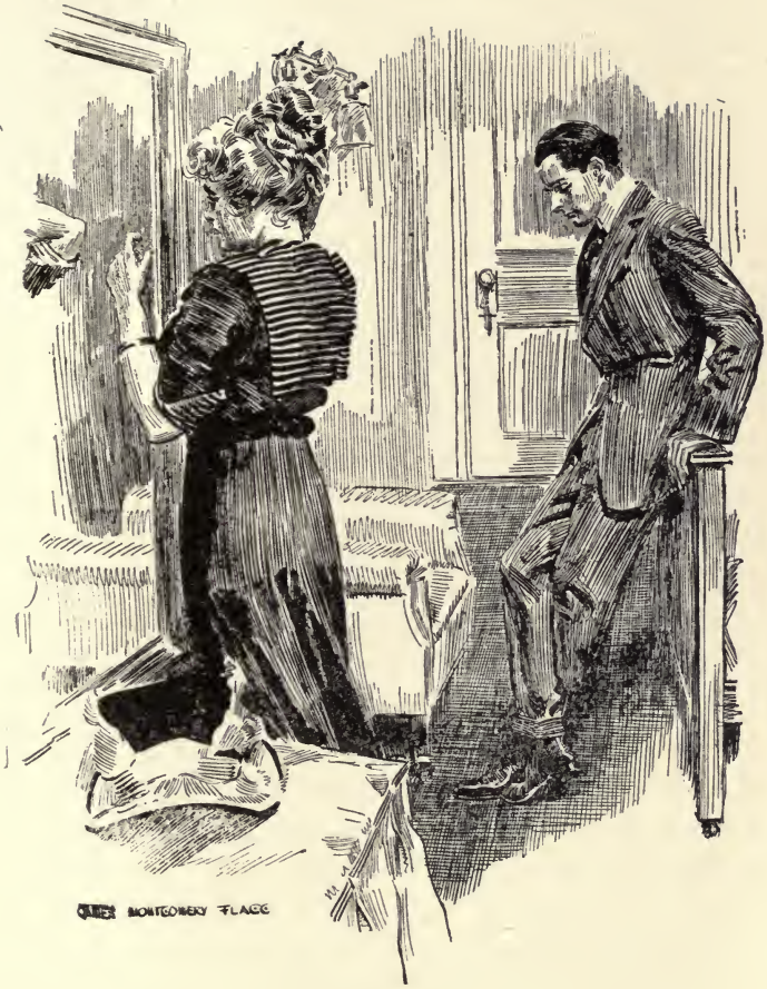
“I’m still in a position to enforce that ordinance against pouting’”—Page 71