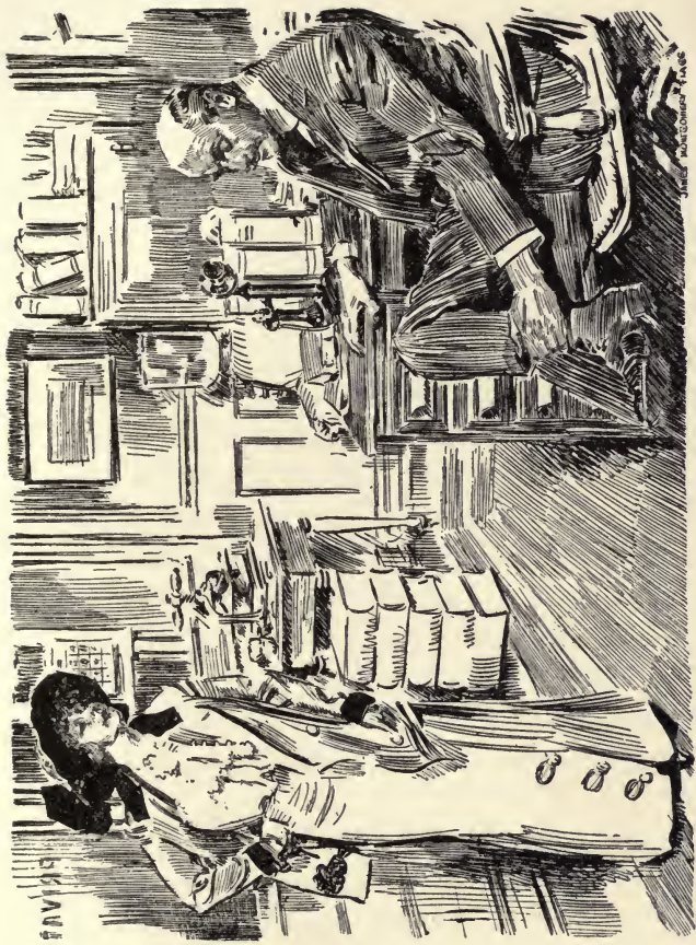
“I’ve lived petticoats, I’ve talked petticoats, I’ve dreamed petticoats—why, I’ve even worn the darn things!”—Page 156