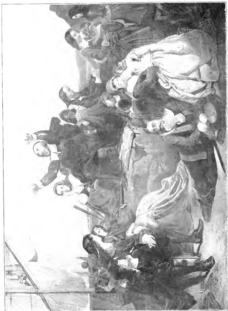
THE DEPARTURE OF THE PILGRIMS REV. JOHN ROBINSON PRONOUNCING "THE BLESSING AND THE B. SEDUCTION" WHEN THEY SAILED FOR AMERICA