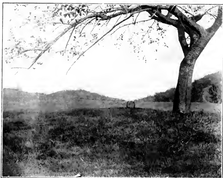
BURIAL PLACE OF DANIEL ROBINSON