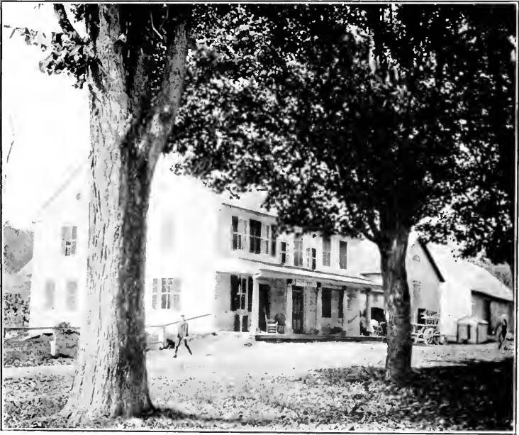
HOMESTEAD OF ZADOCK ROBINSON