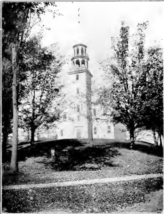
MEETING HOUSE AT STRAFFORD, VT.