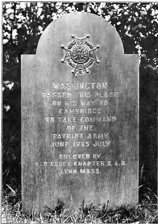
This cut is inserted solely to illustrate the character of the tablets erected in Massachusetts at time of The Washington Pilgrimage.