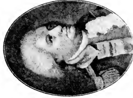
Major-General HENRY KNOX