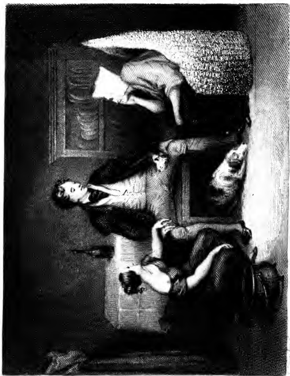
Rory O'More's return home.