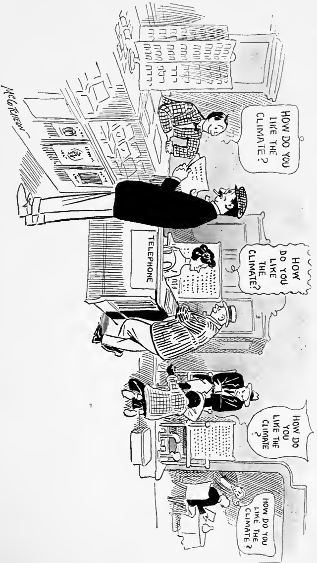
THE BOY WHO SELLS YOU A PAPER AND THE YOUTH WHO BLACKENS YOUR SHOES BOTH SHOW SOLICITUDE