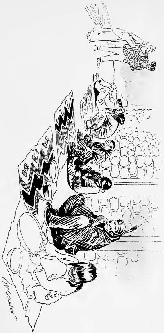
THERE WAS NOT A TURKEY TROTTER IN THE BUNCH