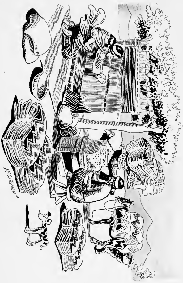
EACH NAVAJO SQUAW WEAVES ON AN AVERAGE NINE THOUSAND BLANKETS A YEAR