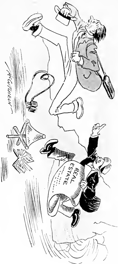
OUT FROM UNDER A ROCK SOMEWHERE WILL CRAWL A REAL ESTATE AGENT