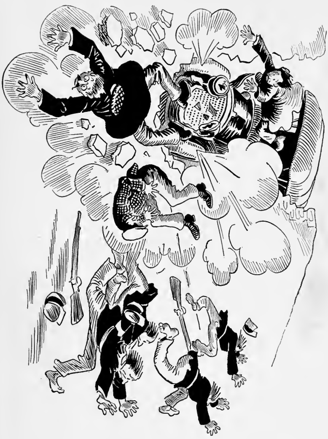
AS THE OCCUPANTS SPILLED SPRAWLINGLY THROUGH THE GAP, A FRONT TIRE EXPLODED WITH A LOUD REPORT