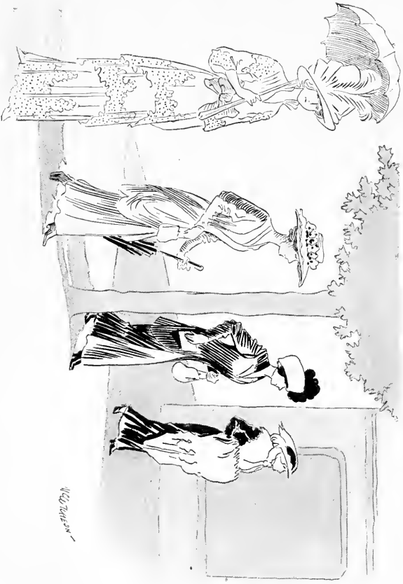
THE WOMAN NEAREST THE WALL HAS ON HER FURS— IT IS ALWAYS COOL IN THE SHADE