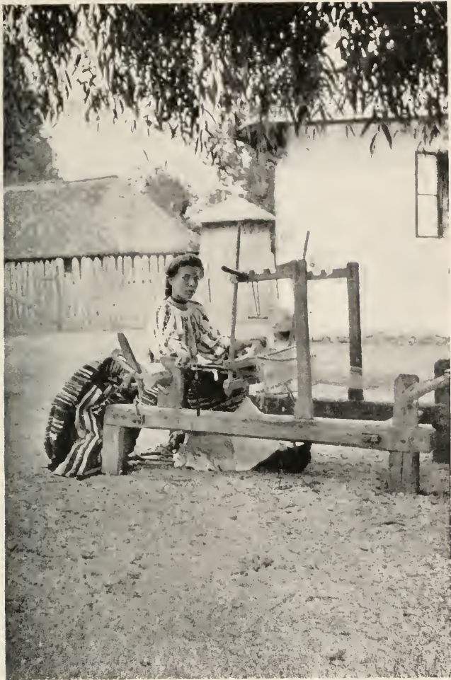
AT HER LOOM