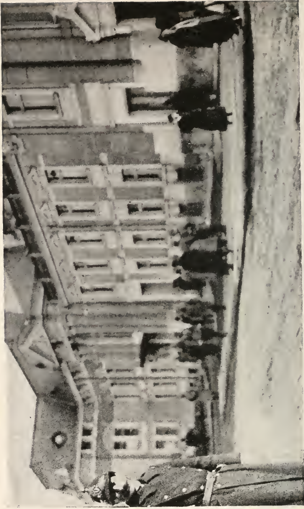
ARRIVAL AT JASSY