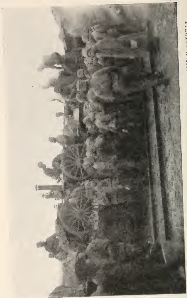
FIELD KITCHEN AT WORK IN A LOCAL STATION DURING THE RUSSIAN RETREAT