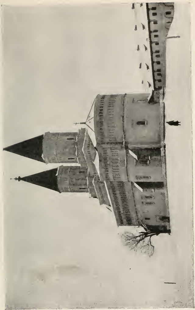
SHIFFANOYA . . . DÉPÔT FOR MOTOR AMBULANCES