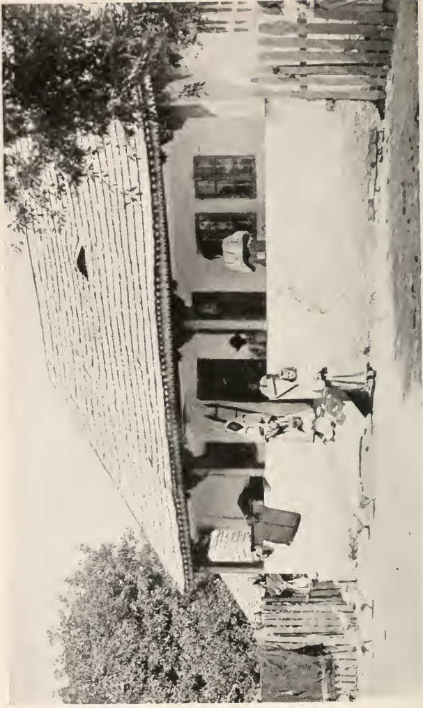
A WELL-TO-DO FARM-HOUSE