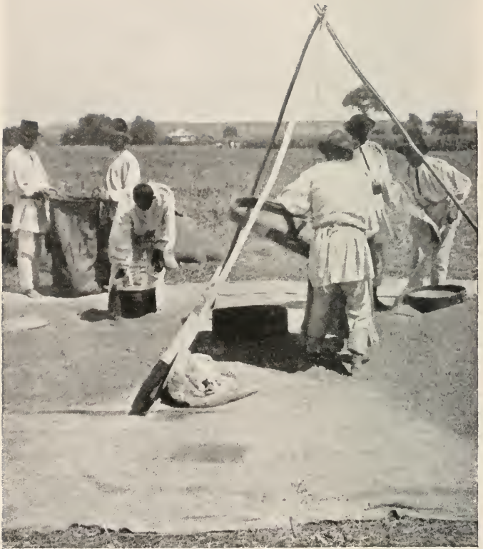
SIFTING THE GRAIN