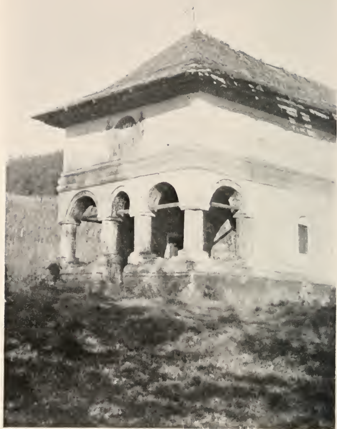
A VILLAGE CHAI EL