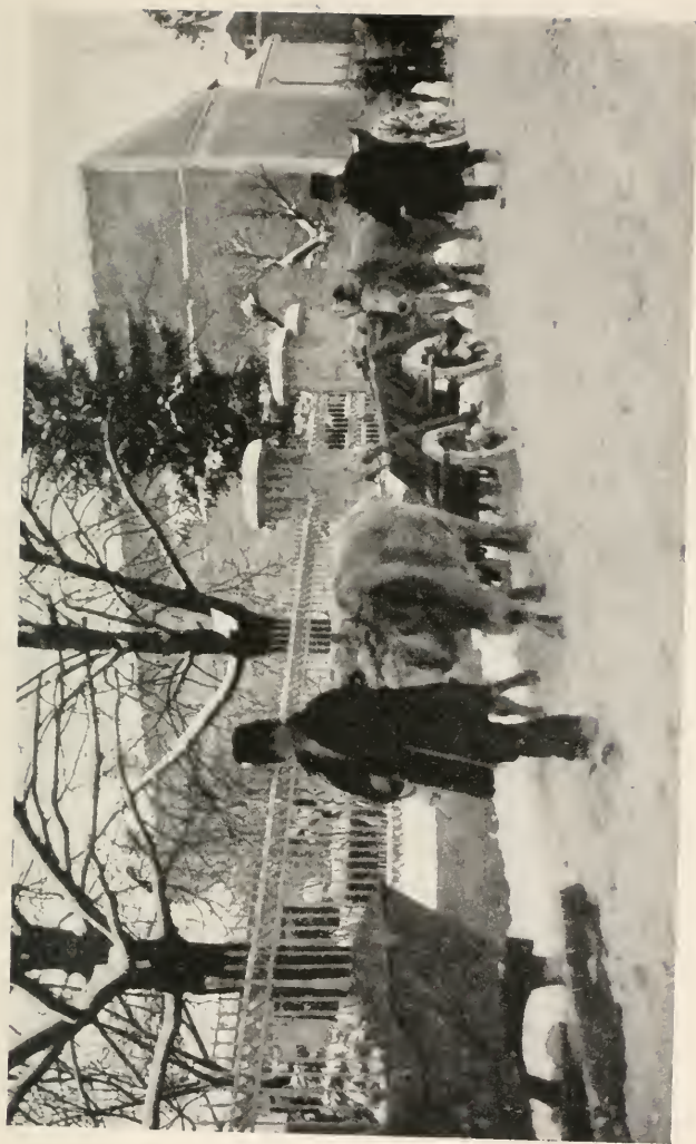
RUSO-ROUMANIAN ARMY SERVICE CORPS DURING THE RETREAT