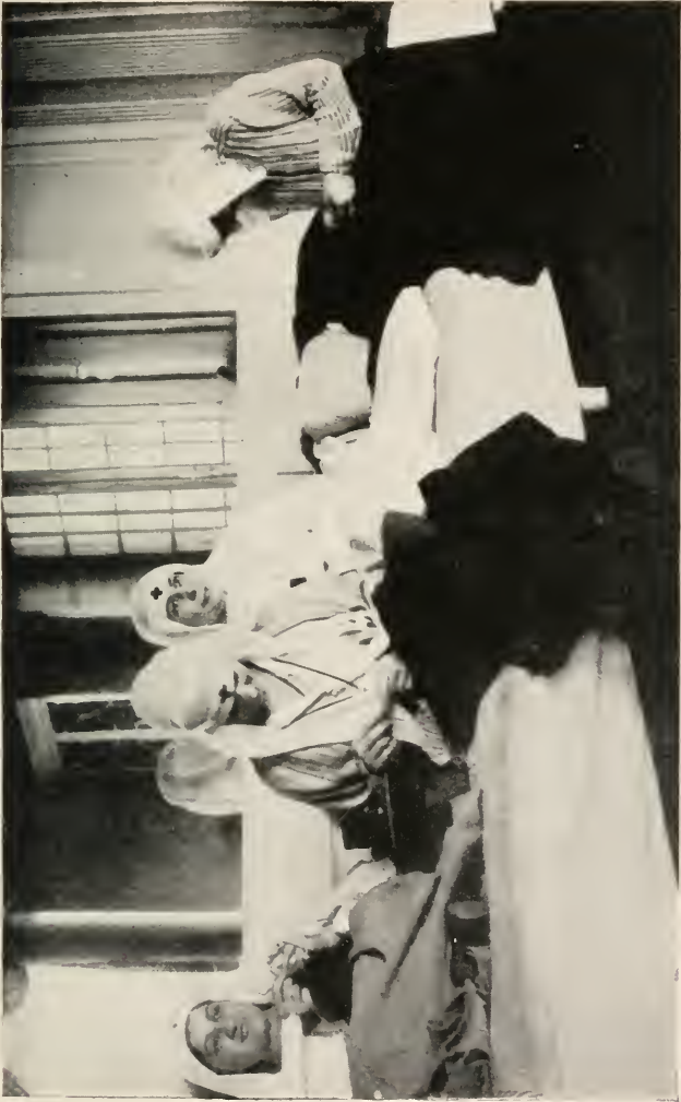
A GROUP OF RED CROSS WORKERS