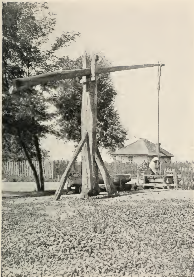
A TYPICAL WATER WELL