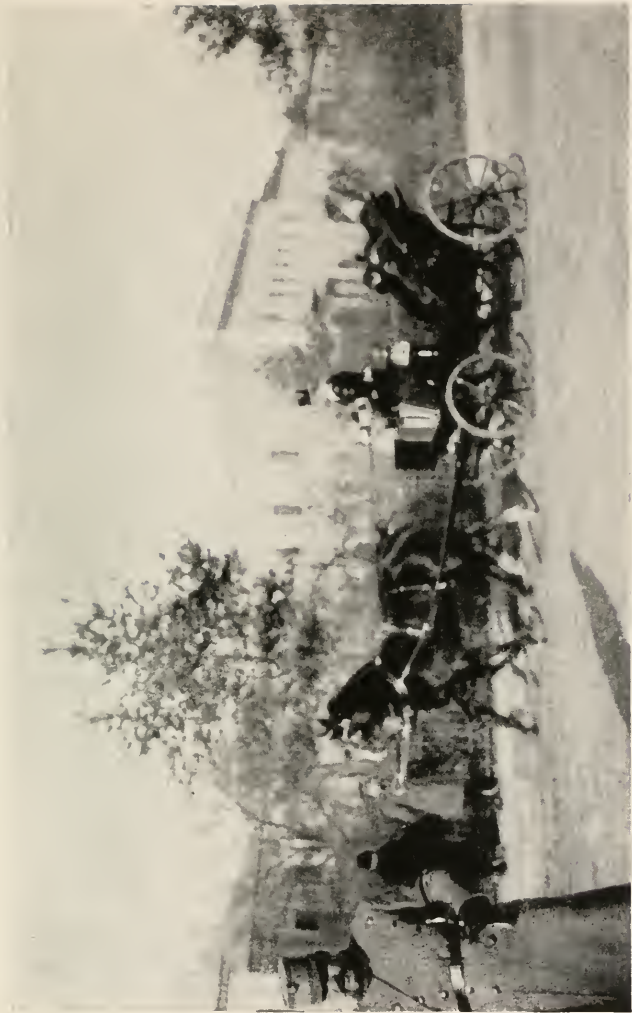
H.M. QUEEN MARIE AFTER THE OPENING OF PARLIAMENT