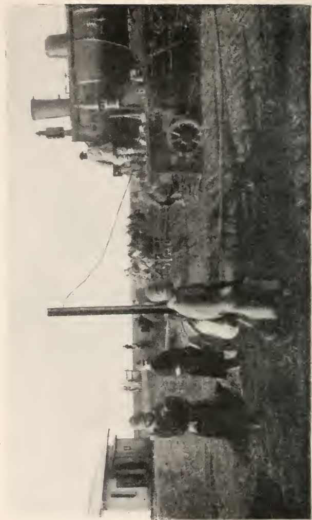
EVEN ENGINES CARRIED HUMAN FREIGHT DURING THE RETREAT