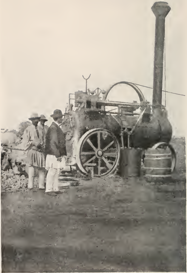
ONE OF THE NEW STEAM PLOUGHS