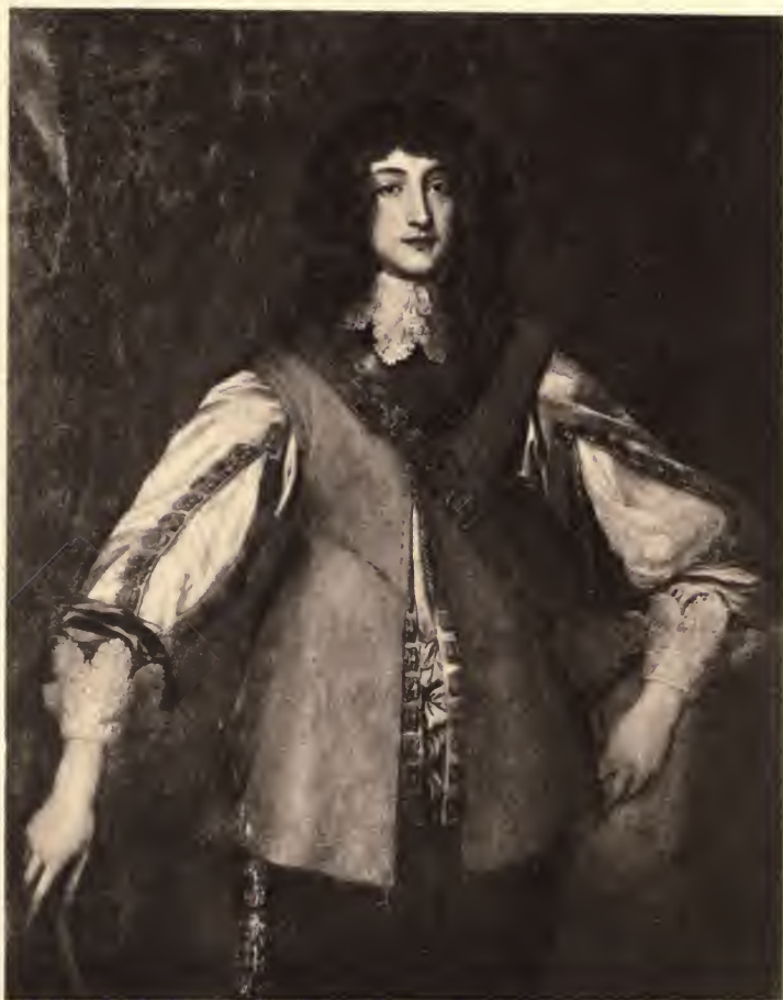
Prince Rupert by Van Dyck.