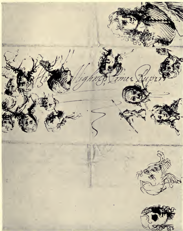
SKETCHES ON AN ENVELOPE. BY PRINCE KUPERT. From a Print in the British Museum.