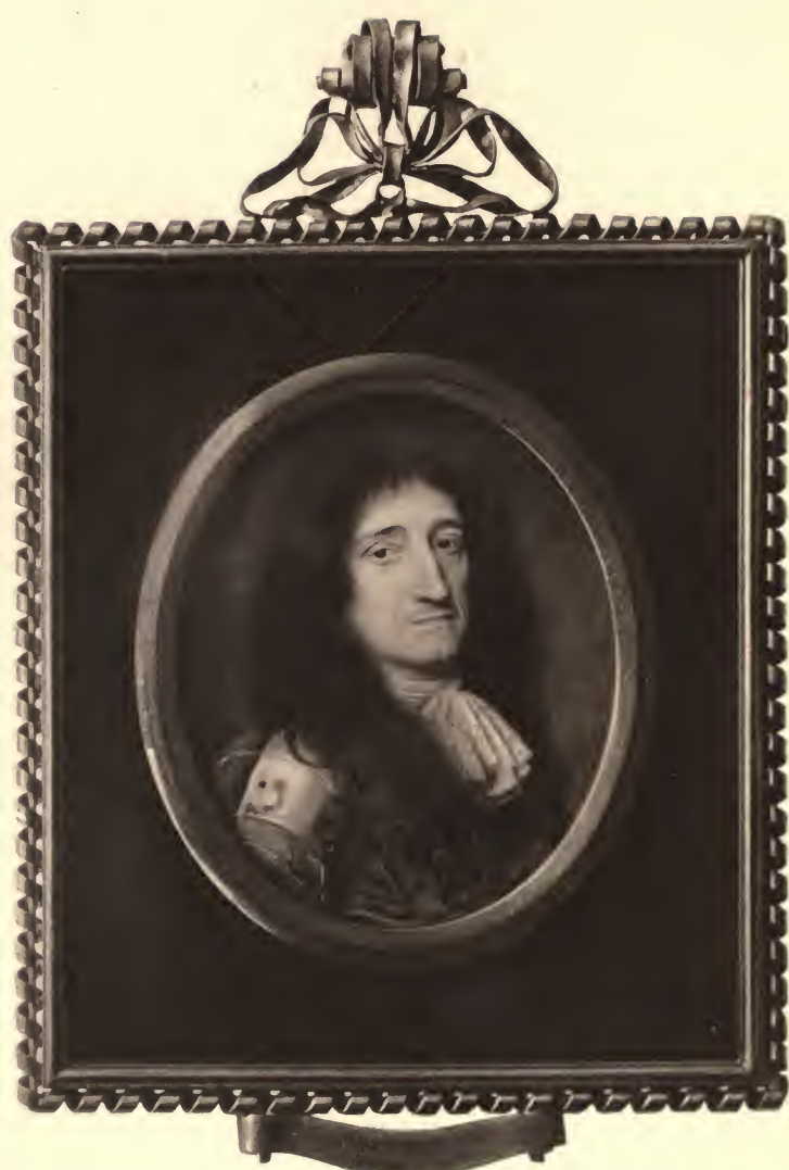
Prince Rupert by Samuel Cooper.