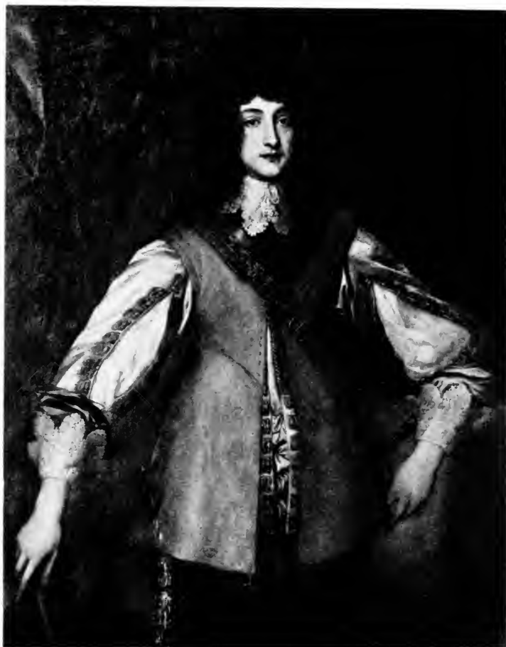
Prince Rupert by Van Dyck.

Reproduced by kind permission of The Earl of Sandwich.