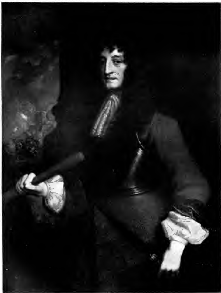
PRINCE RUPERT.