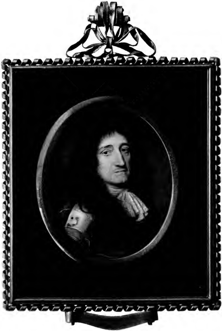
Prince Rupert by Samuel Cooper.

THE LONDON ASTOR LENOX TILDEN FOUNDATION