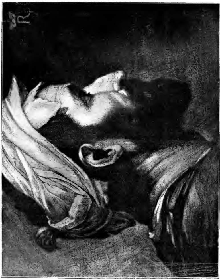
HEAD OF THE EXECUTIONER OF SAINT JOHN. After the mezzotint by Prince Kupert.