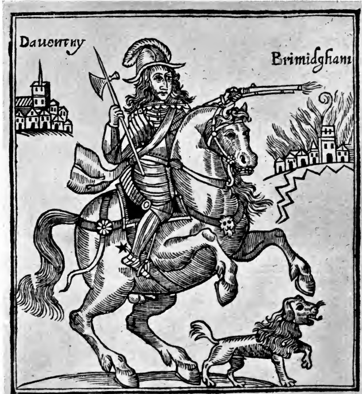
The most Illustrious and High borne PRINCE RUPERT, PRINCE ELECTOR, Second Son to FREDERICK KING of BOHEMIA, GENERALL of the HORSE of H's MAJESTIES ARMY, KNIGHT of the Noble Order of the GARTER.

CONTEMPORARY CARICATURE OF PRINCE RUPERT. From a Print in the British Museum.