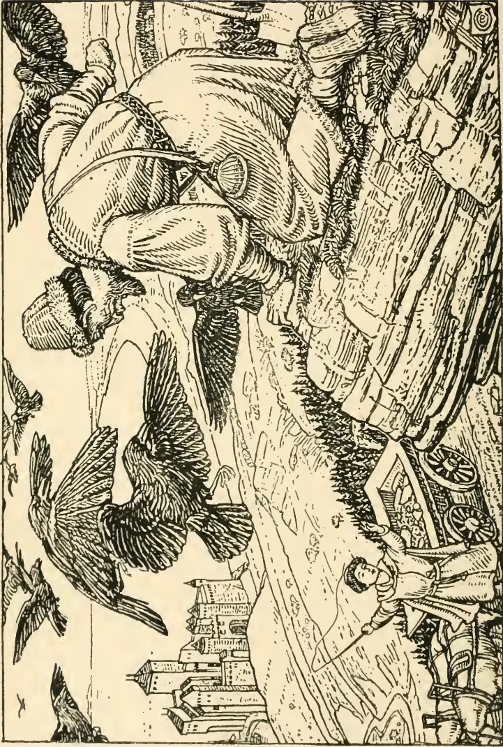
THE GOLDEN MOUNTAIN.