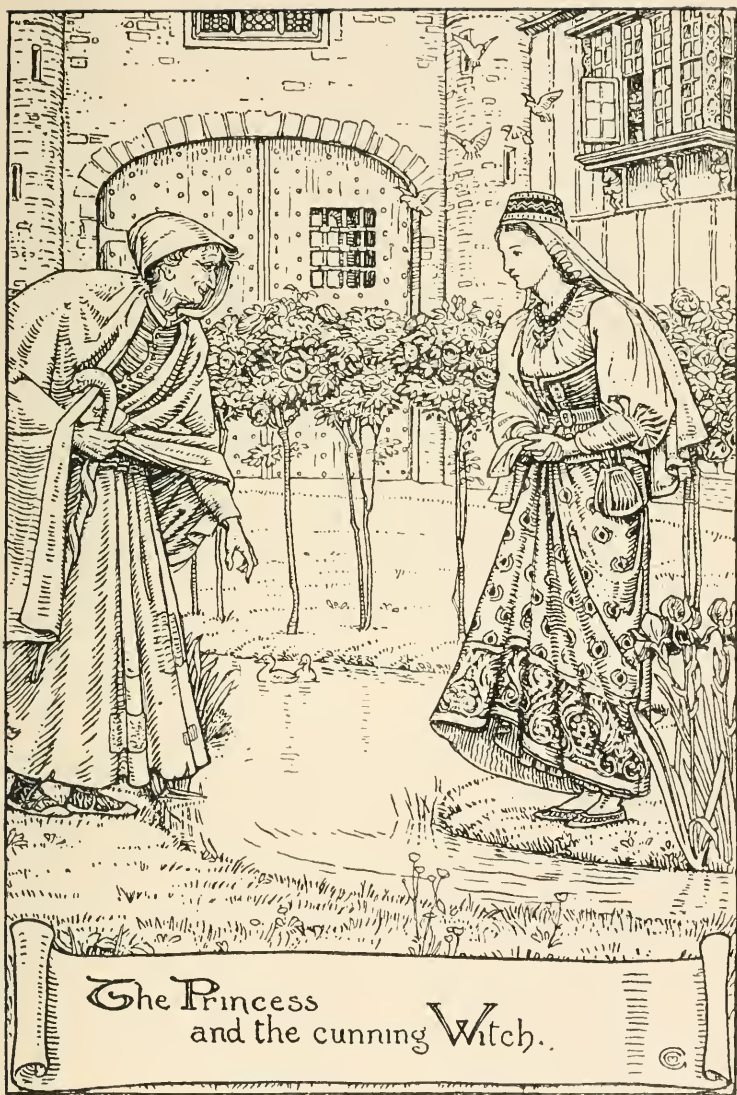
The Princess and the cunning Witch.