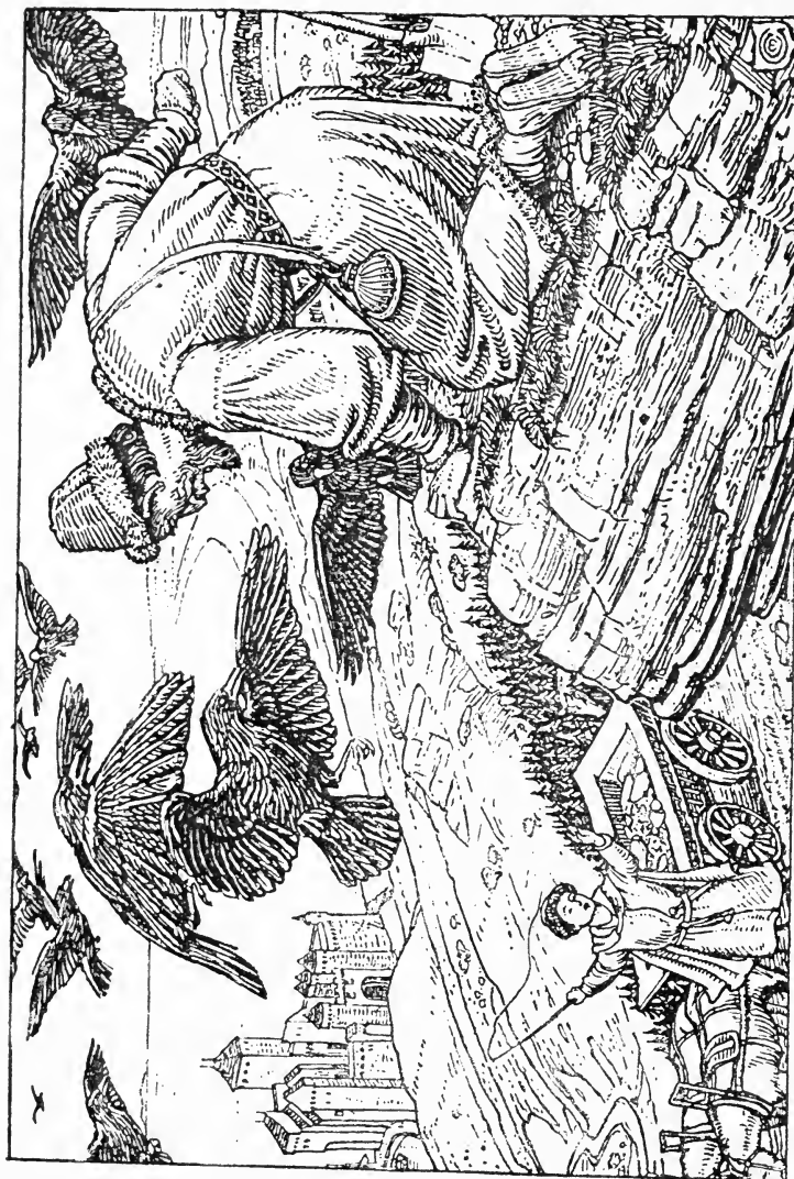
THE GOLDEN MOUNTAIN.