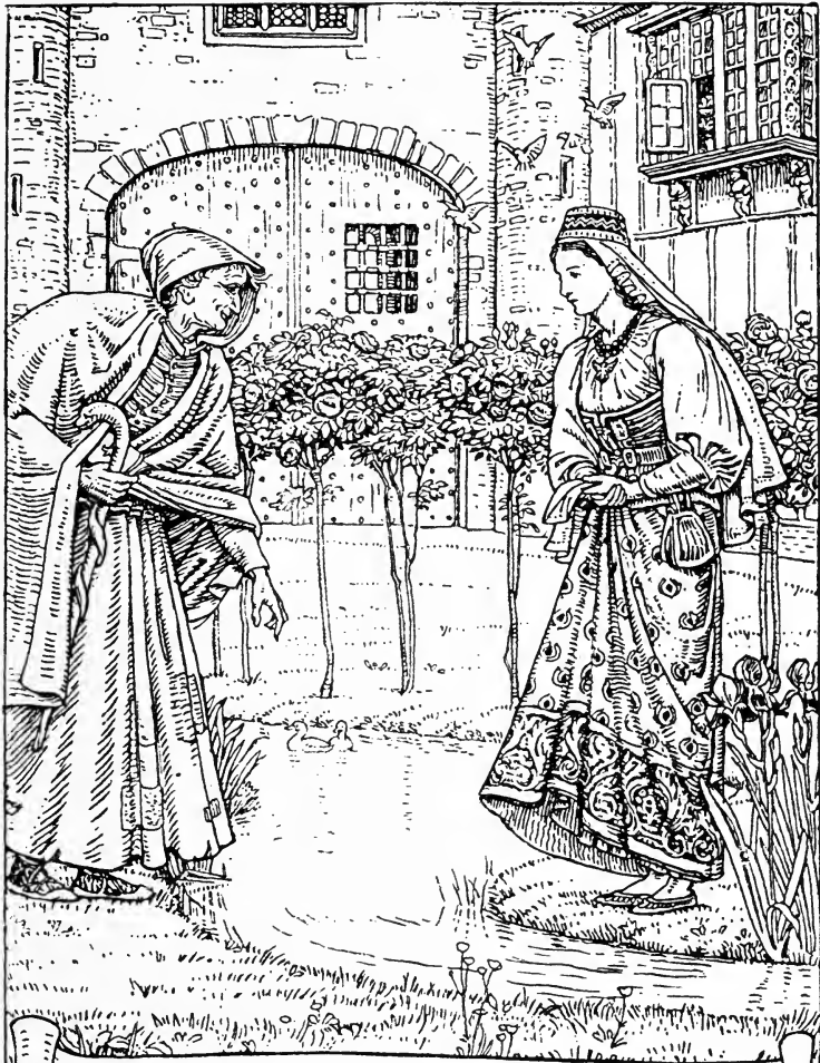
The Princess and the cunning Witch.