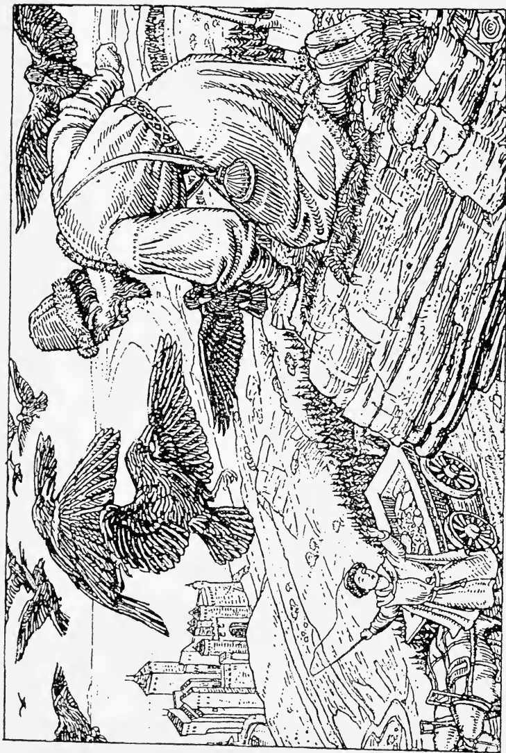
THE GOLDEN MOUNTAIN.