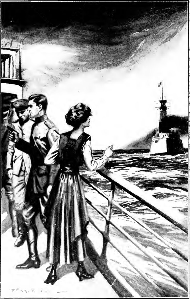
THERE WAS A GRAY, SWIFTLY STEAMING SHIP BEARING DOWN UPON THE ADMIRAL PEKHARD. Ruth Fielding Homeward Bound. Page 204