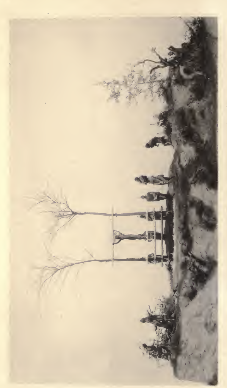
MINIATURE GROUP SHOWING THE MORNING STAR SACRIFICE.