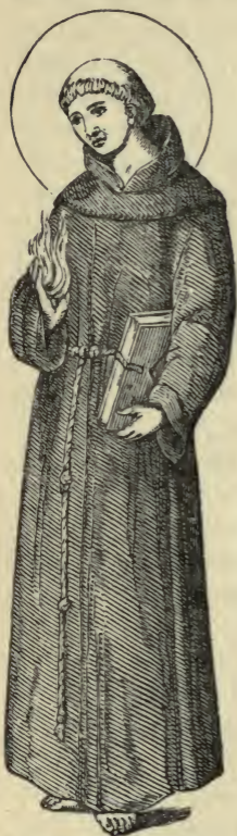
St. Antony of Padua (Sienese School)

people to St. Antony was overwhelming,—indeed it speedily became even embarrassing! And as