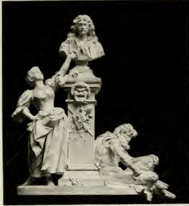
M. Stengelin "Rising Tide" 1896

M. Stengelin has represented with perfect truth, and a simplicity not devoid of dignity, the swift race of waves rushing up to take the beach by storm. Under their reiterated shock the fishing boats are slowly beginning to float. As the tide rises past them, and its ponderous breakers dash into foam on the shore, they unfurl their