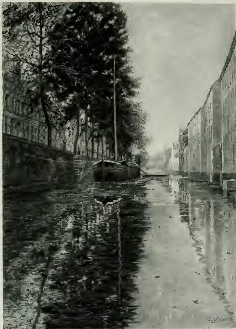
LOW WATER IN GHEENT