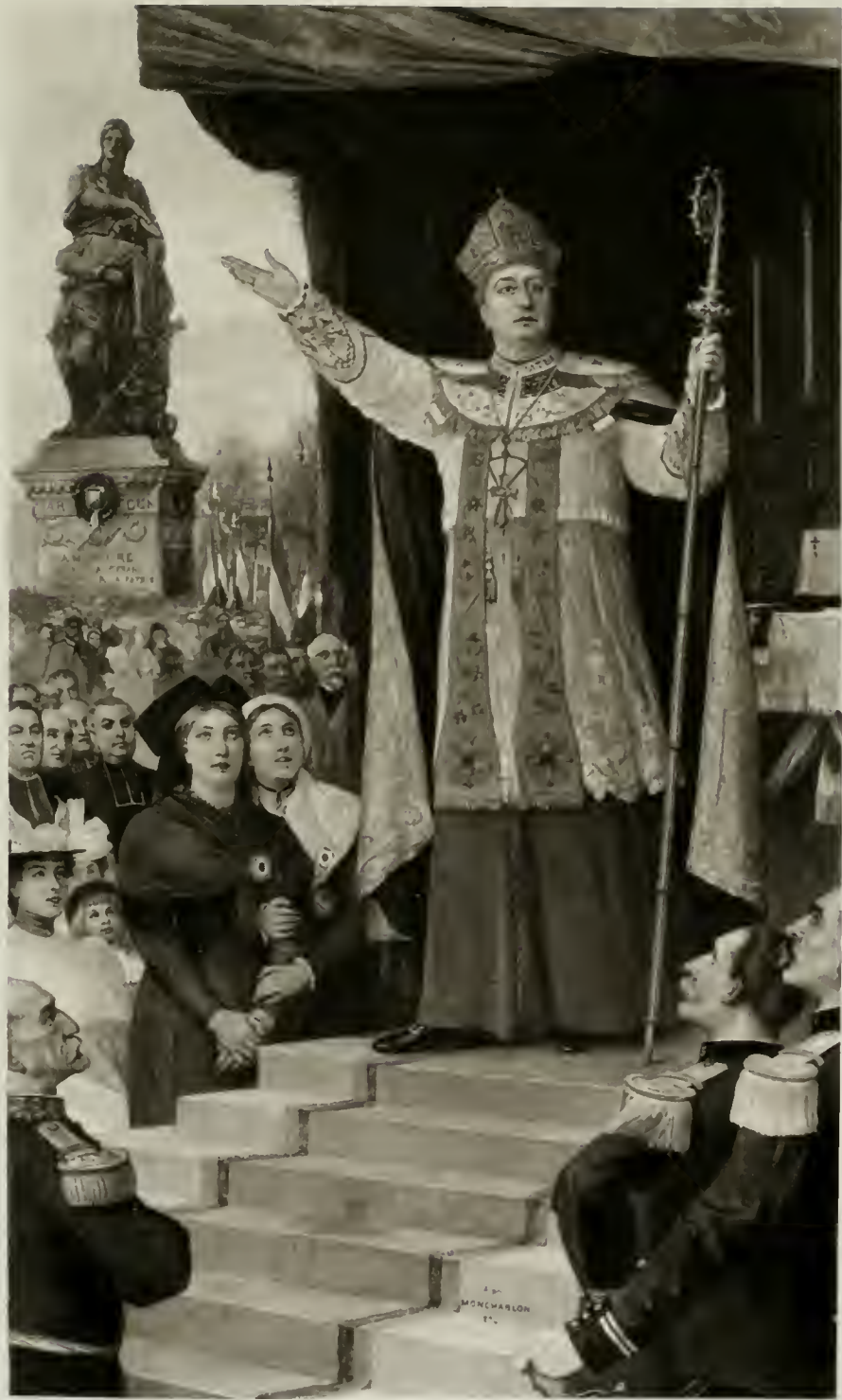
THE 70th ANNIVERSARY OF THE BATTLE OF MARIGNELLE