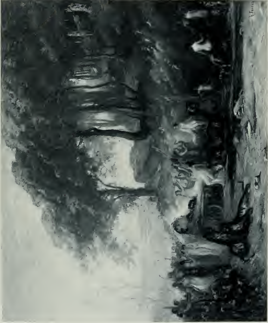
A PAGAN PROCESSION