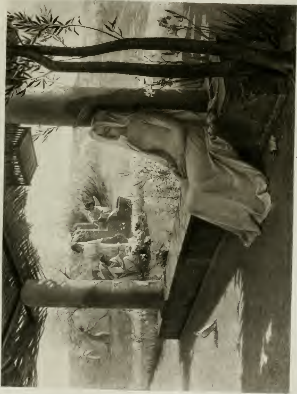
THE GARDEN AT BENO