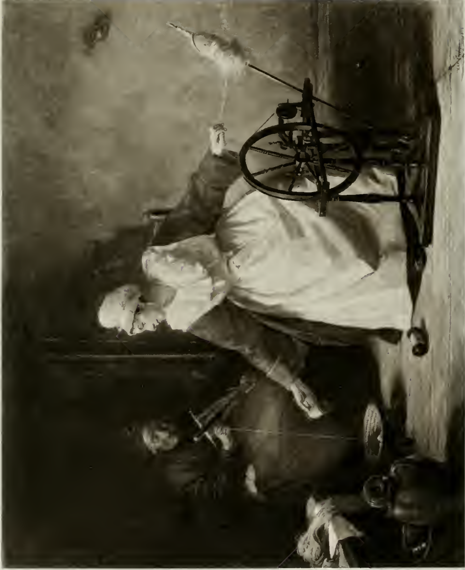
THE SPINNING WHEEL