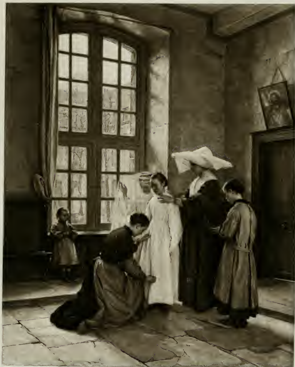
DRESSING FOR THE PROCESSION