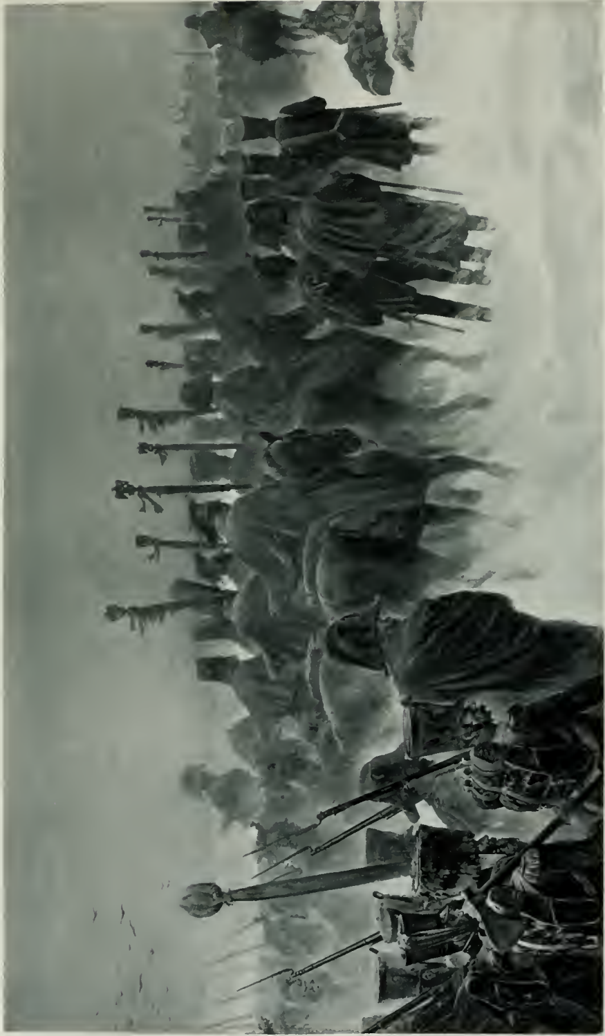
Approach of the British to the battle of Waterloo