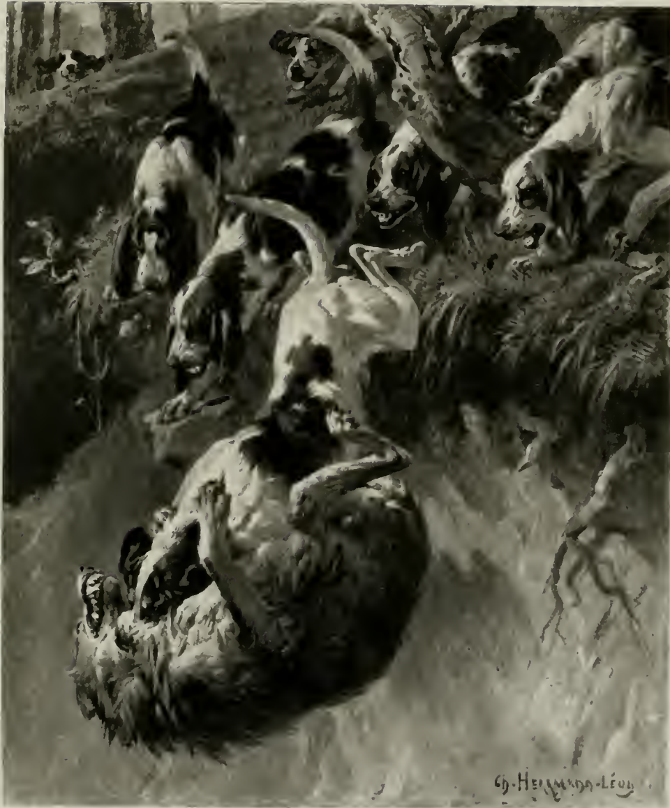
THE DEATH OF THE WOLF