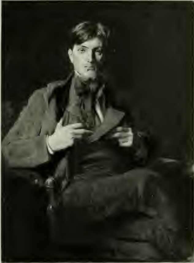
BENJAMIN - CONSTANT — Portrait of the Artist 1807

But what jury will dare to adopt this radical and simple remedy? It would expose them at one fell stroke to all the fury of the young; and in these days of struggle for life, the young are ferocious.