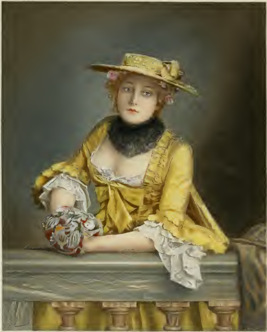
“She is of the Bristol family.”