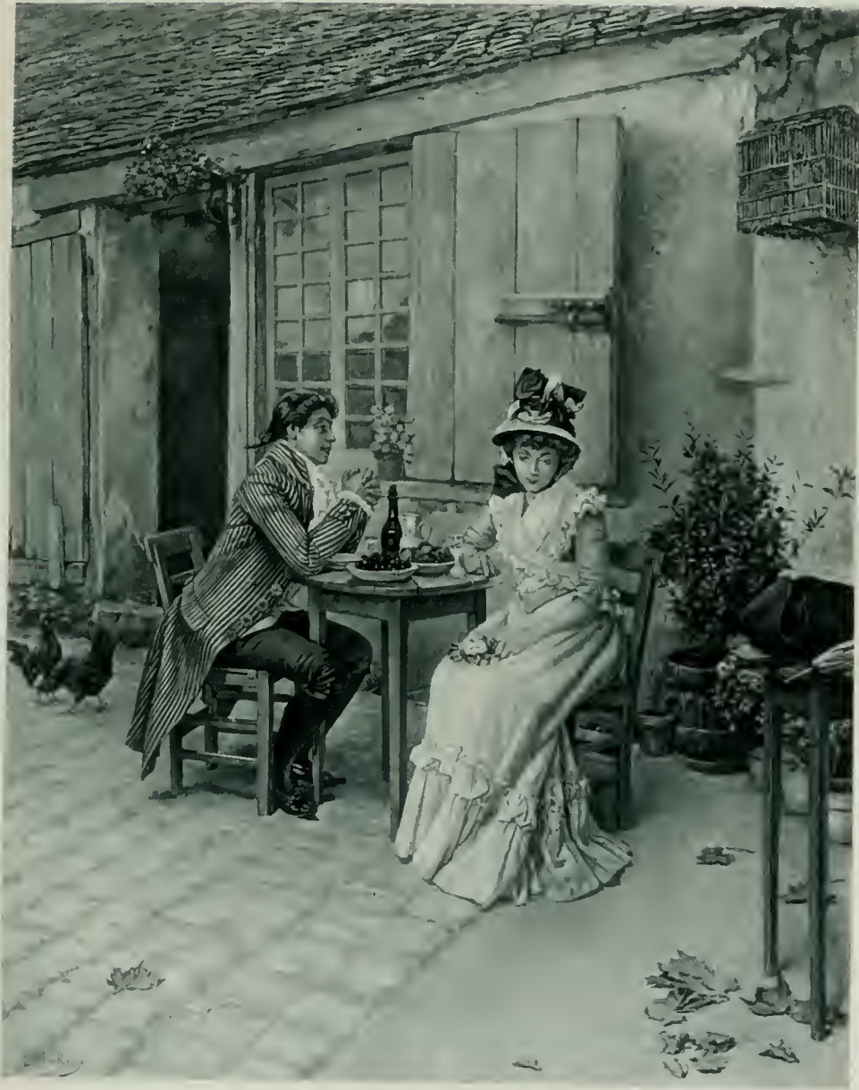
A RUSTIC INN