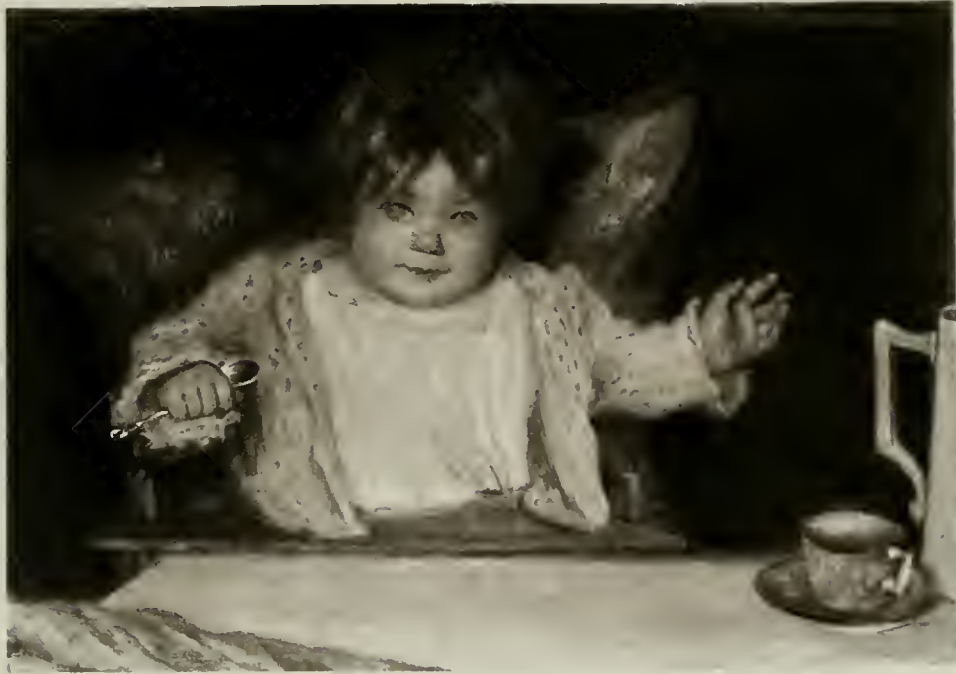
J.M.W. Turner Breakfast

the professor a very narrow strip of window lets in the light which sparkles on mysterious liquids contained in glass bottles, and sheds a little brightness on the picture. We should be glad if we rather