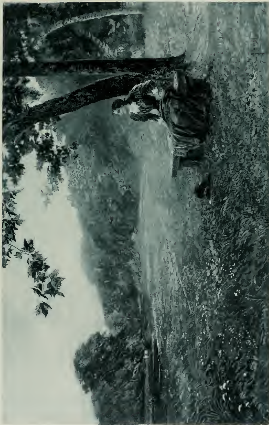
THE LAST OF THE SUMMER