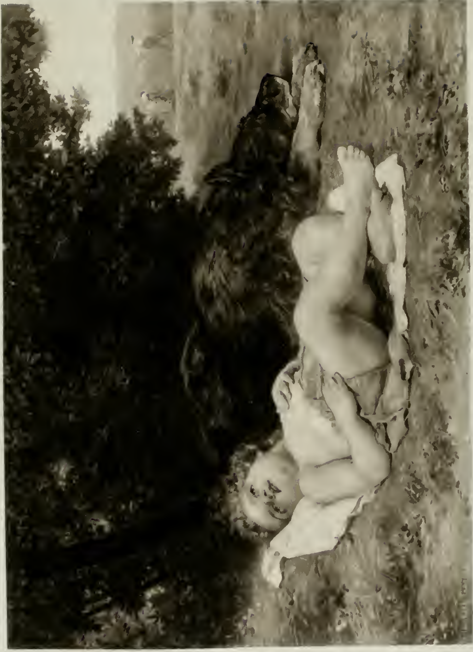
Opposite page