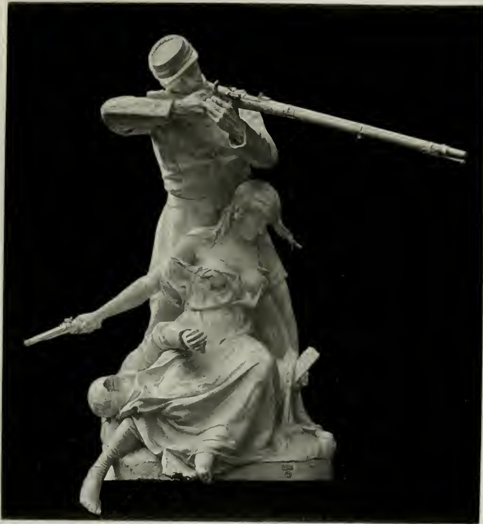
M. F. O. R. O. D. I. N.

a master in figures of strikingly modern feeling combined with really antique grace. In his statue of "Meditation" he seems to