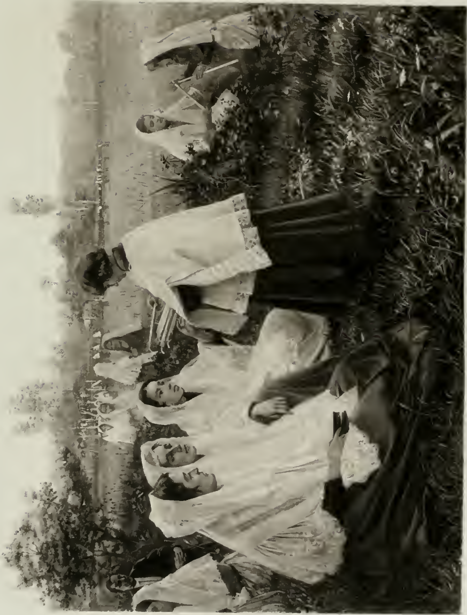
THE BROTHERS OF THE ORDER OF THE HOLY SPIRIT