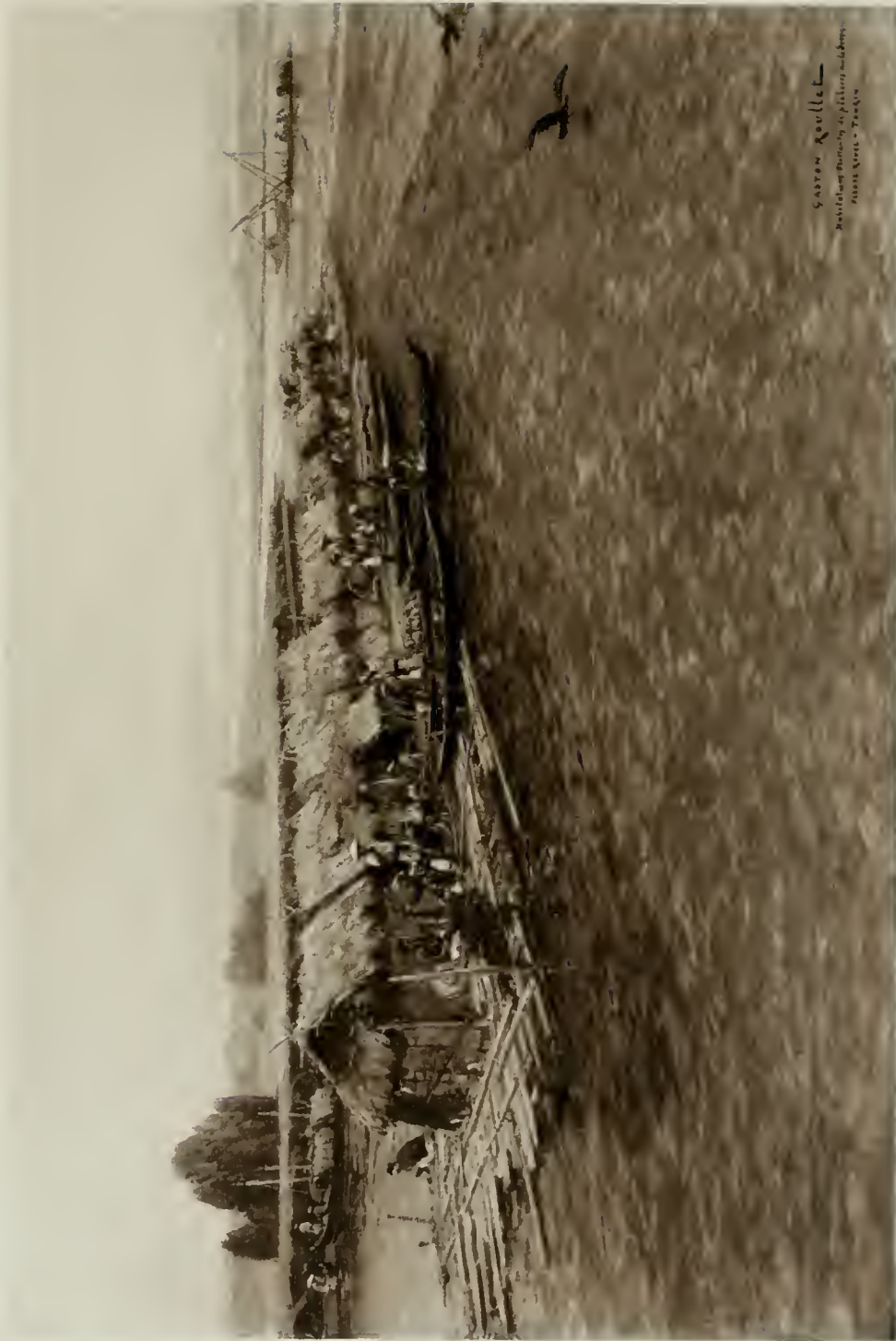
RIVER DWELLINGS IN TONKIN