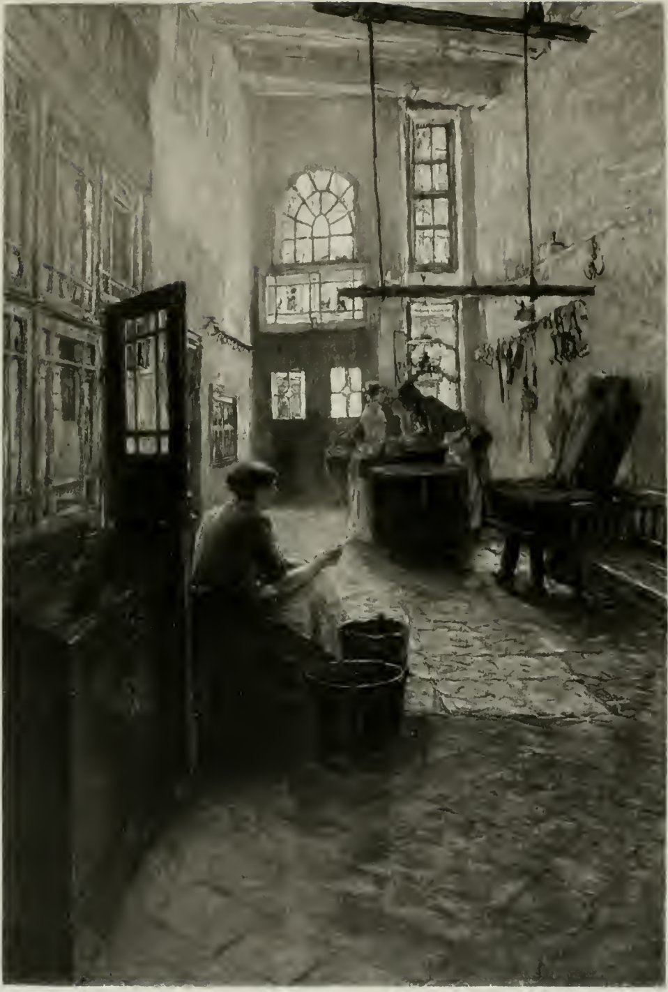
Interior of a factory, showing workers at their stations.