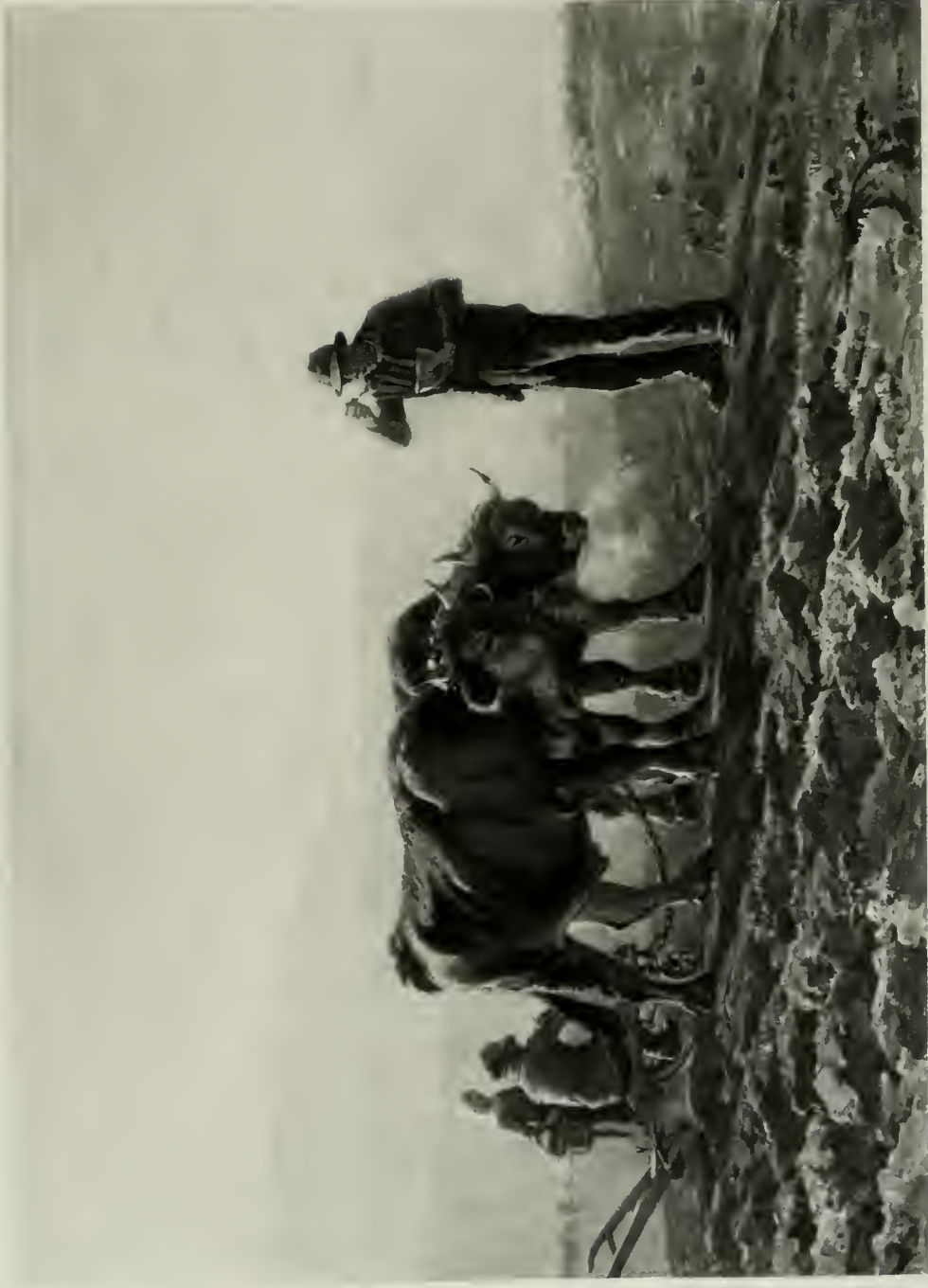
A BOWL OF SOUP