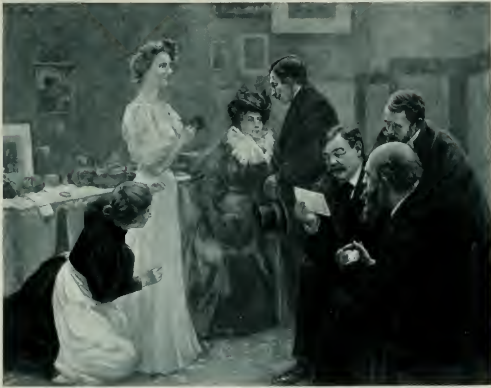
H ALBERTI — Mlle Yvette Guilbert's dressing Room

And in front of this lady two kings are groveling on their knees. For her men, also nude, are killing each other. Perched on the