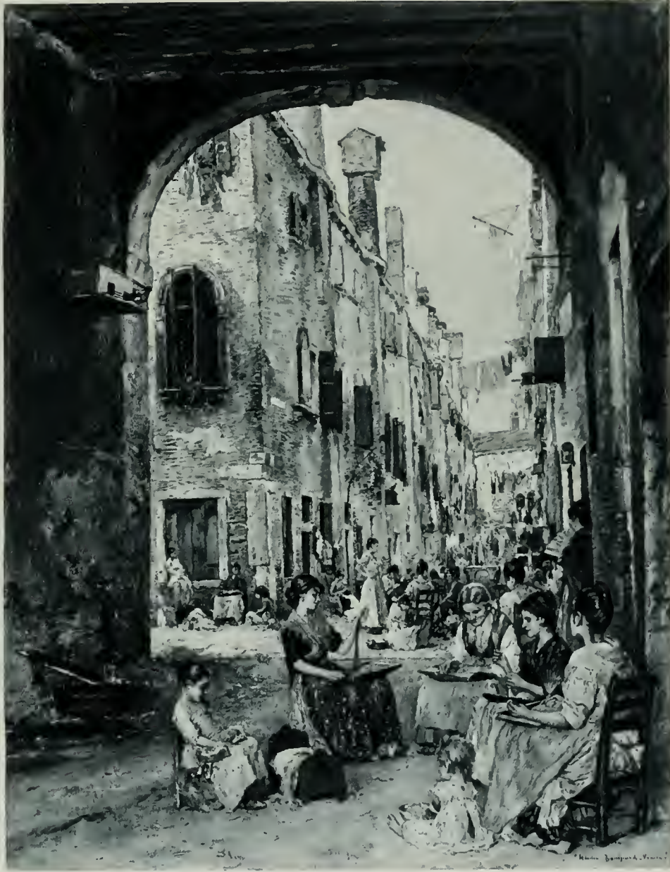
BEAD THREADING IN VENICE