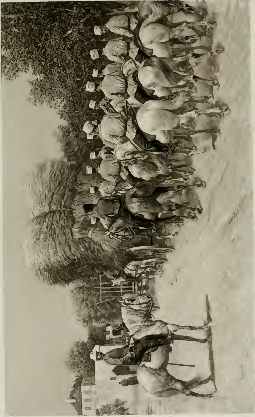
A FORAGING PARTY IN ALGIERS