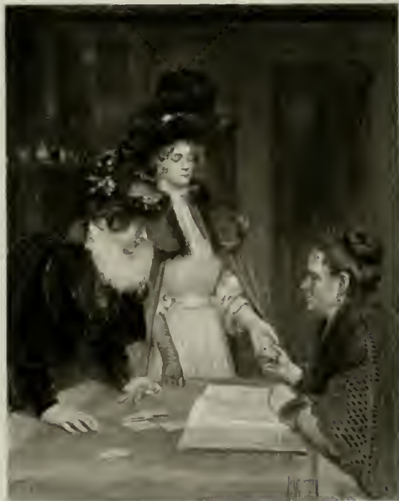
MELLE M. GUYON The Flower Seller

Serious qualities are not lacking in an interesting little picture by M. Lambert, "Five o'clock." The attitude of the young mother, suckling her baby of a few months old, as she sits by the stove where the soup is simmering, is exactly and amusingly