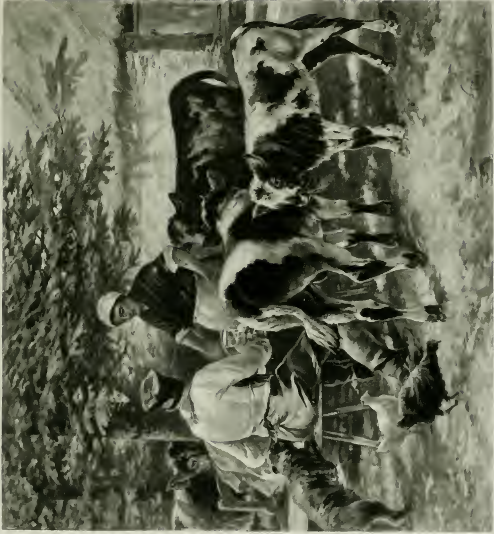
CALVES FOR SALE