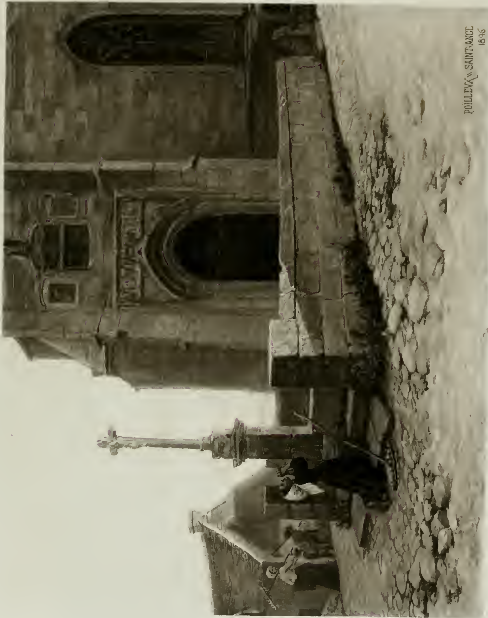
POILLEUX - SAINT ANGE 1896