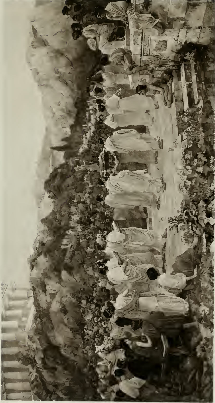
AN ANTIQUE FESTIVAL