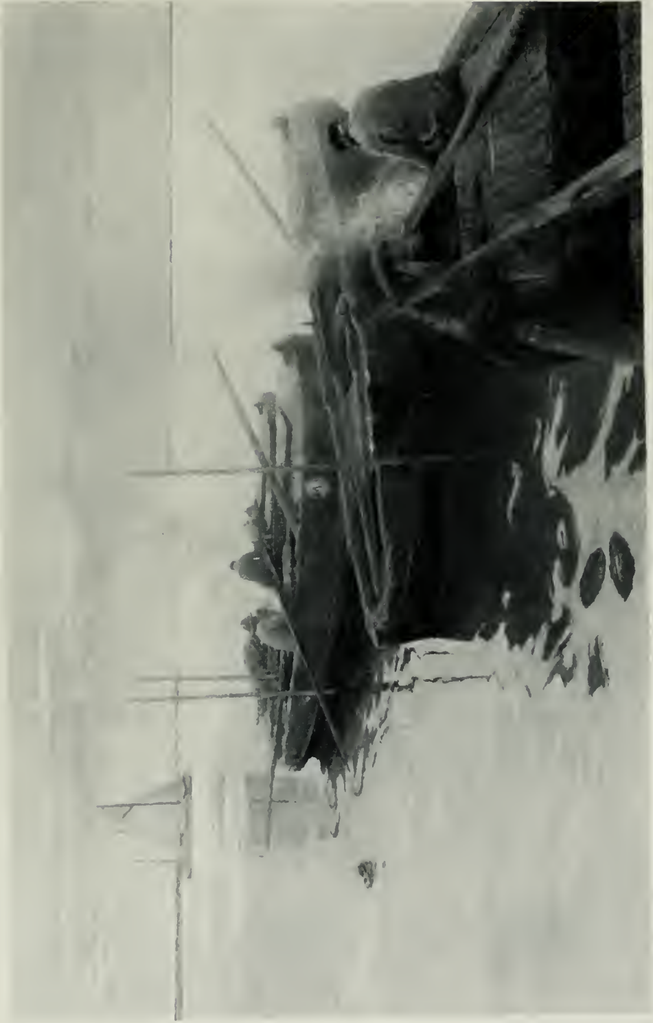
VIEW OF THE BARRAGE