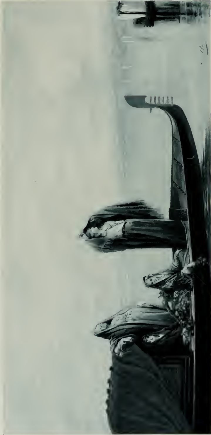
THE RETURN TO MURANO