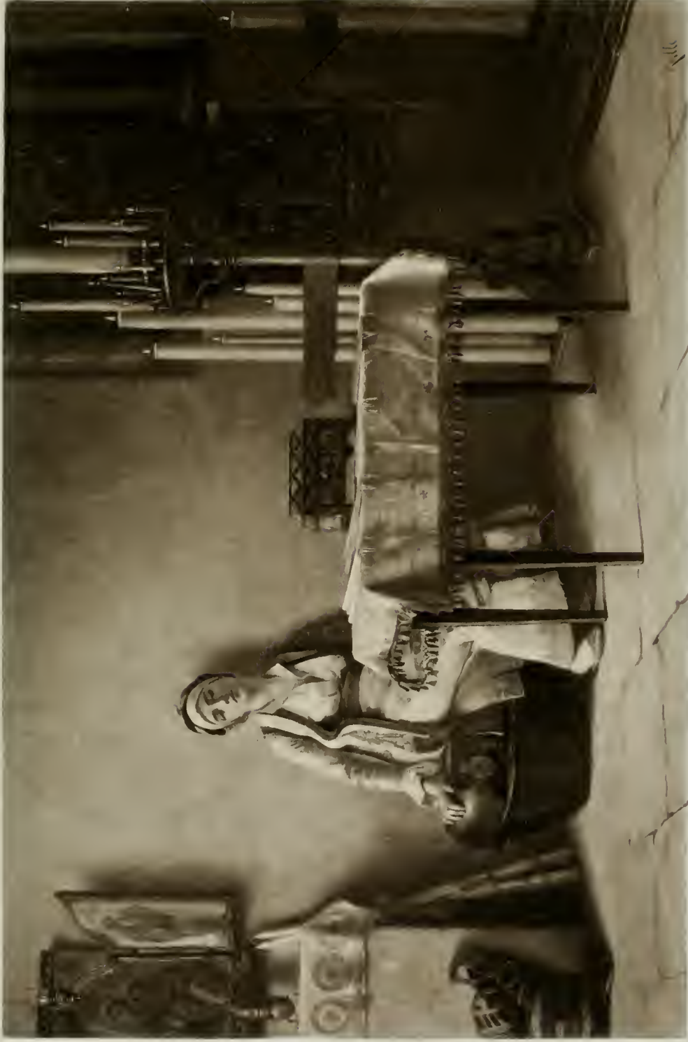
A WOMAN SELLING TAPERS IN A GREEK CHURCH