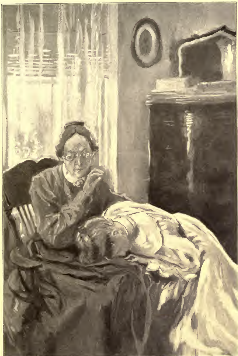
She laid her pretty head in my-lap, sobbin' out, "What shall I do? What shall I do?"—Page 214.