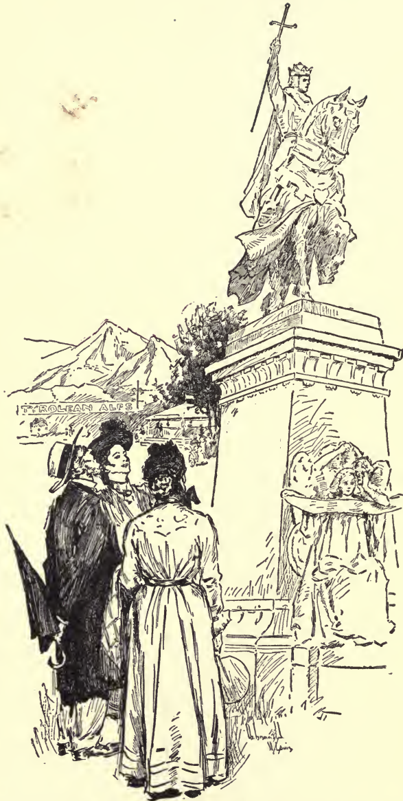
“ Right in the center sets Saint Louis himself on a prancin’ horse, holdin’ up a cross ”