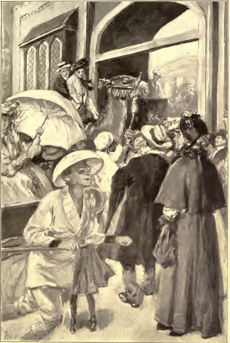
It is the big crowd that is surgin' through the Pike to and fro, fro and to.—Page 187.