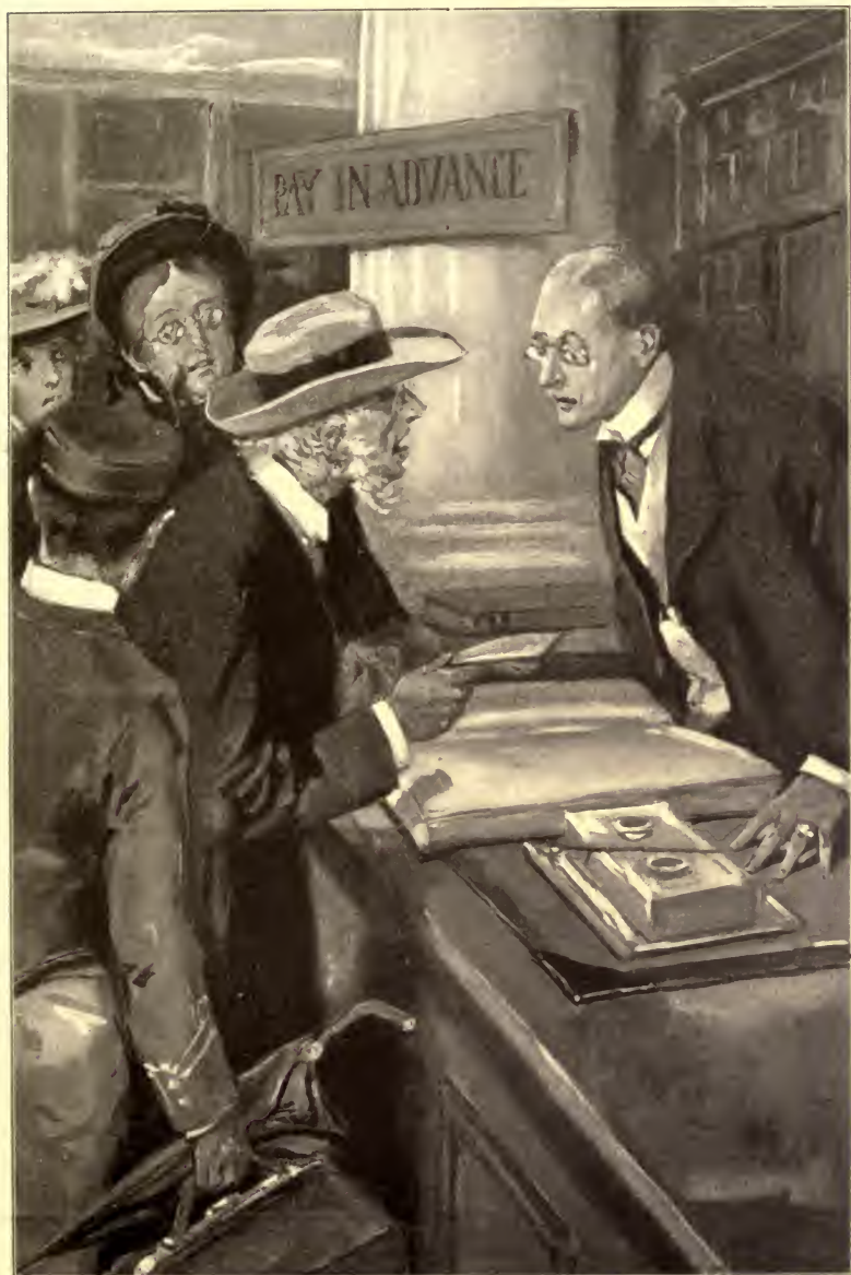
He showed 'em in a careless way as much as fifteen dollars in cash.—Page 70.