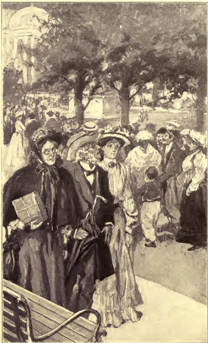
Good land! I couldn't sort 'em out and describe them that passed by in an hour.— Frontispiece. Page 83.