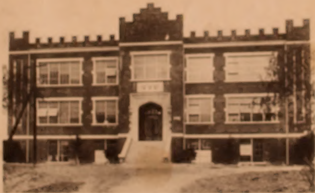
Thelma's building - Ryegate, N.H. [Signature]