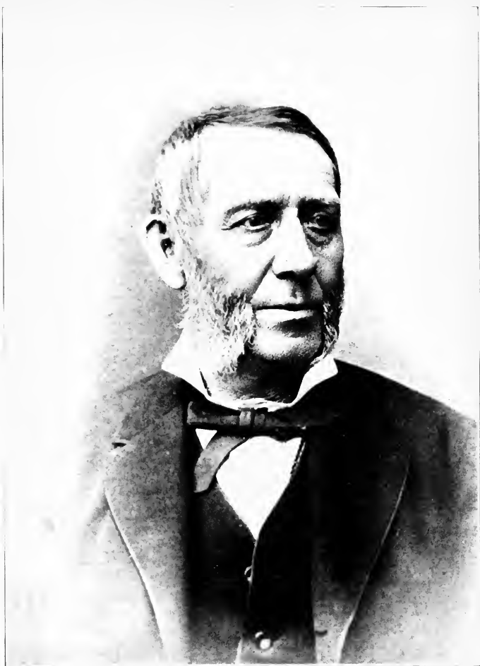
SAMUEL J. KIRKWOOD