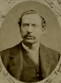
J. F. KENNEDY.