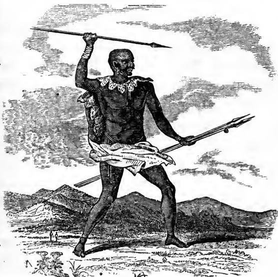
MACOMO, THE GAIKA CHIEF, IN 1834.