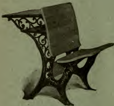
THE VICTOR DESK