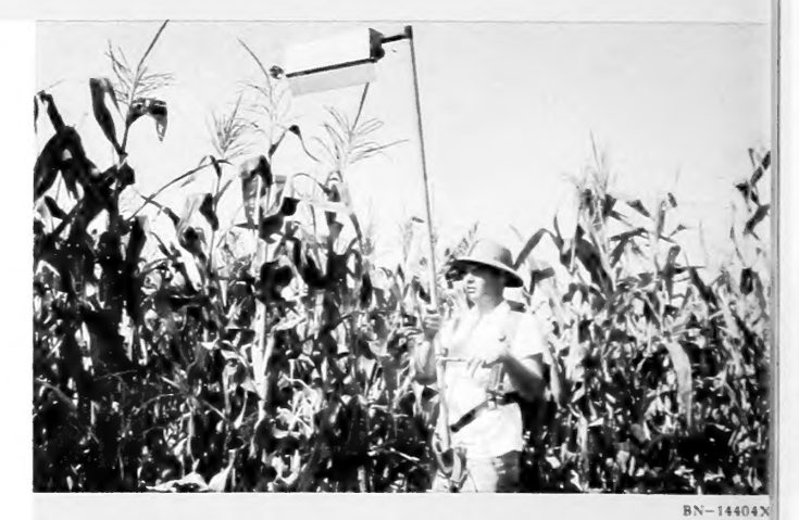
Application of insecticide granules to experimental corn plot.

This leaflet names the fields of research in which the Entomology Research Division is active. It also lists salaries and job benefits, summarizes qualification requirements, and tells how to get additional information.