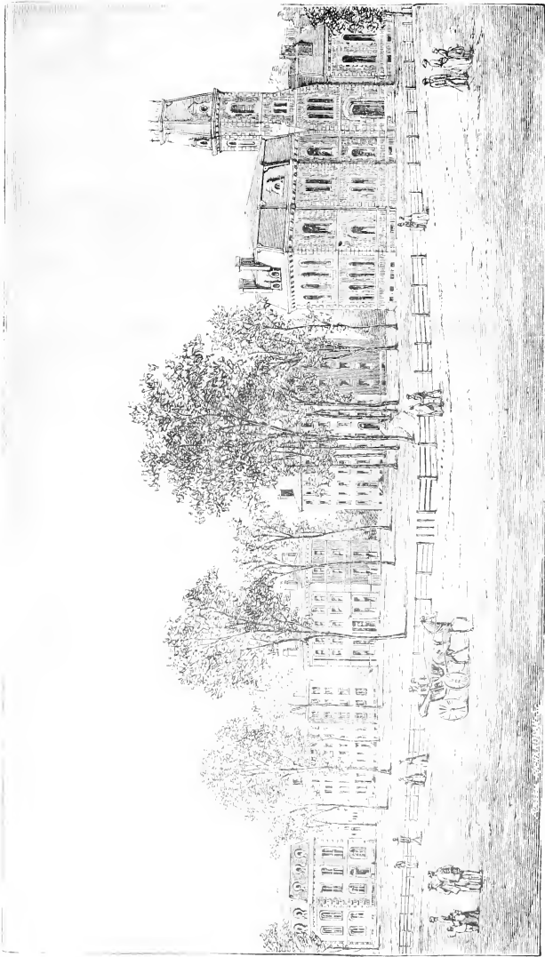
Column Hall. Gymnasium. Chaplin Hall.