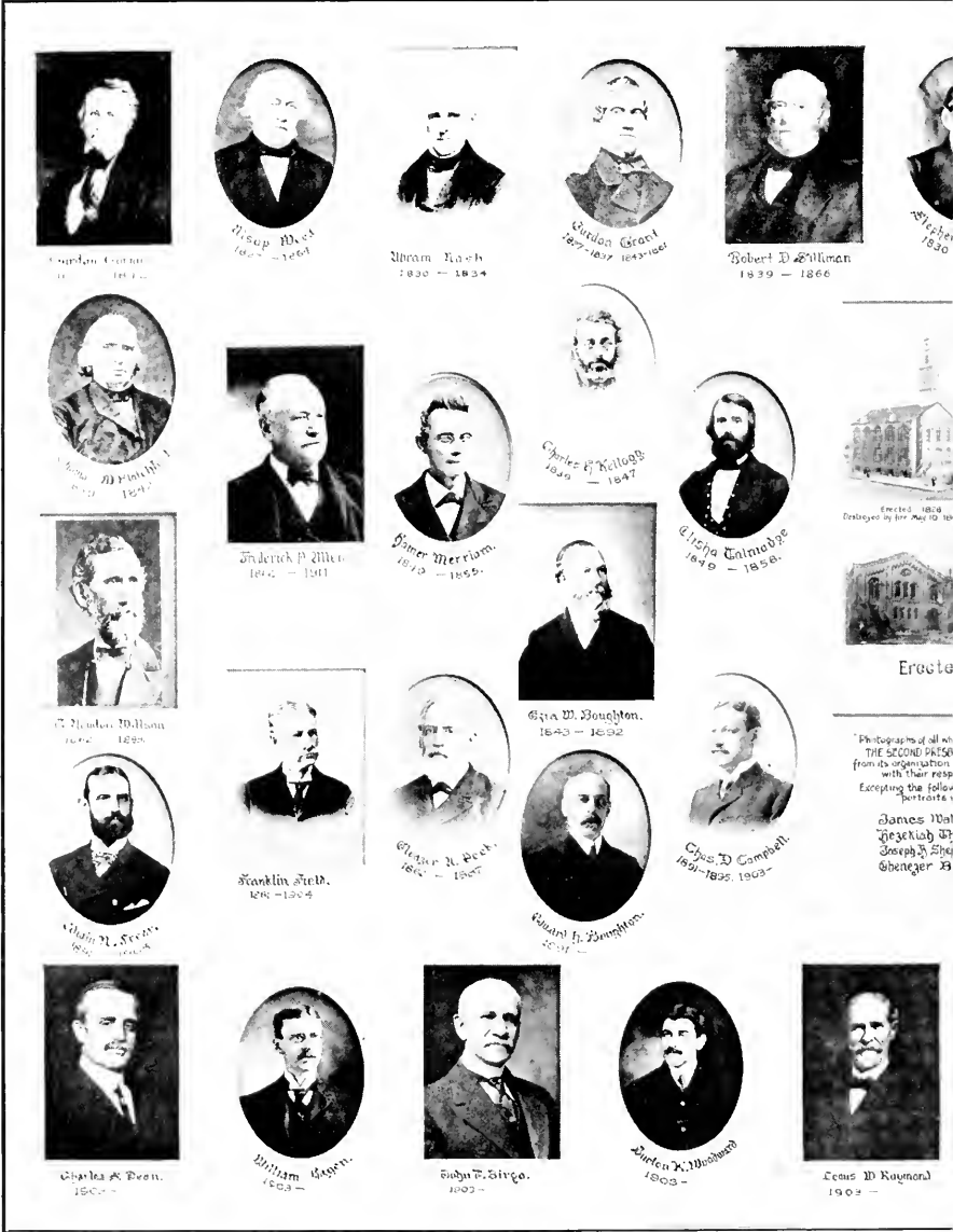
Photographs of all who have served as Elder from its organization