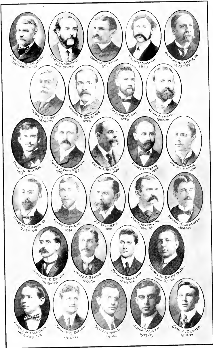
Presidents of Young People's Christian Union.