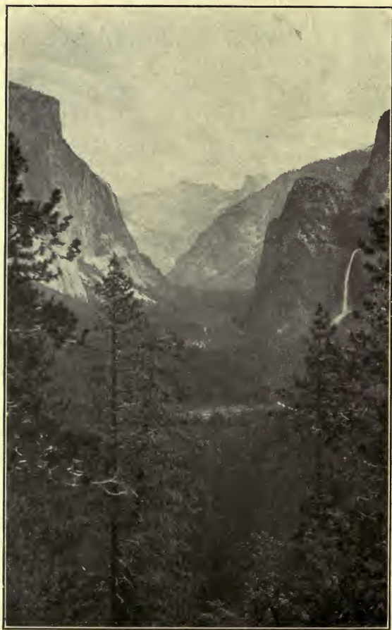
The Yosemite Valley