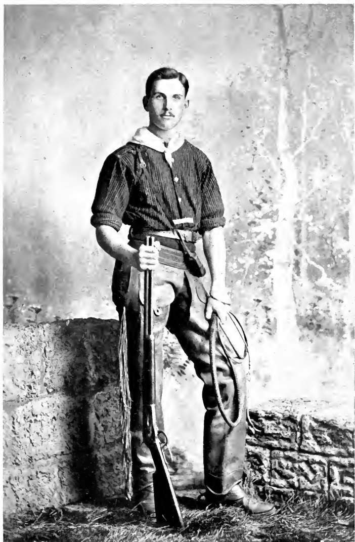
THE WRITER AT CALGARY, 1891.