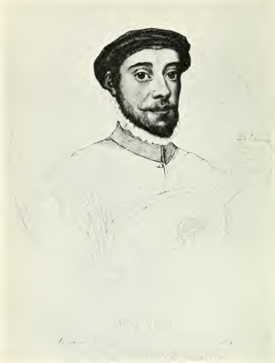
DAVID RIZZIO (From Lord Ruthven's "Relation")