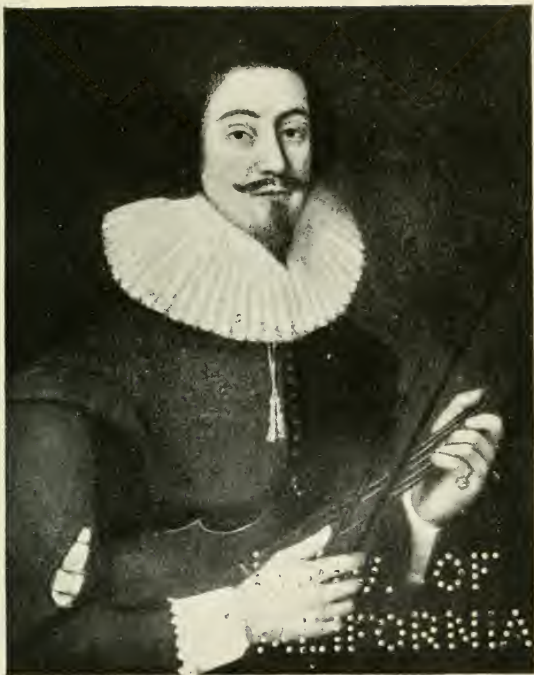
DAVID RIZZIO (Lord Seaforth's Portrait)