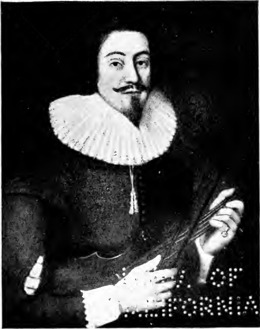
DAVID RIZZIO (Lord Seaforth's Portrait)