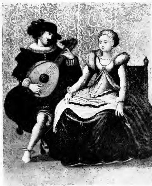
QUEEN MARY AND HER SINGER (The Smeaton-Hepburn Picture)