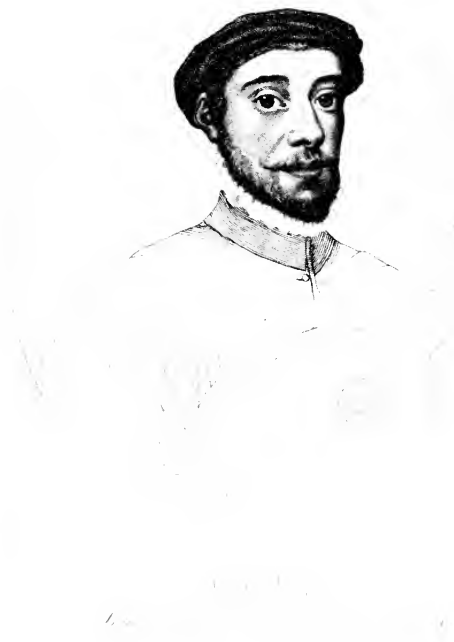
DAVID RIZZIO (From Lord Ruthven's "Relation")