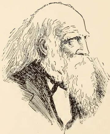
WILLIAM CULLEN BRYANT