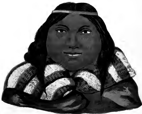
PATAGONIAN OF CAPE GREGORY.

Both drawn from Lithographs taken of the Originals in England by Sarah A. Myers