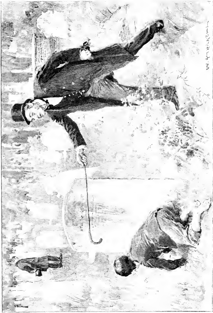
TOMMY CROUCHED BEHIND HAGGART'S STONE