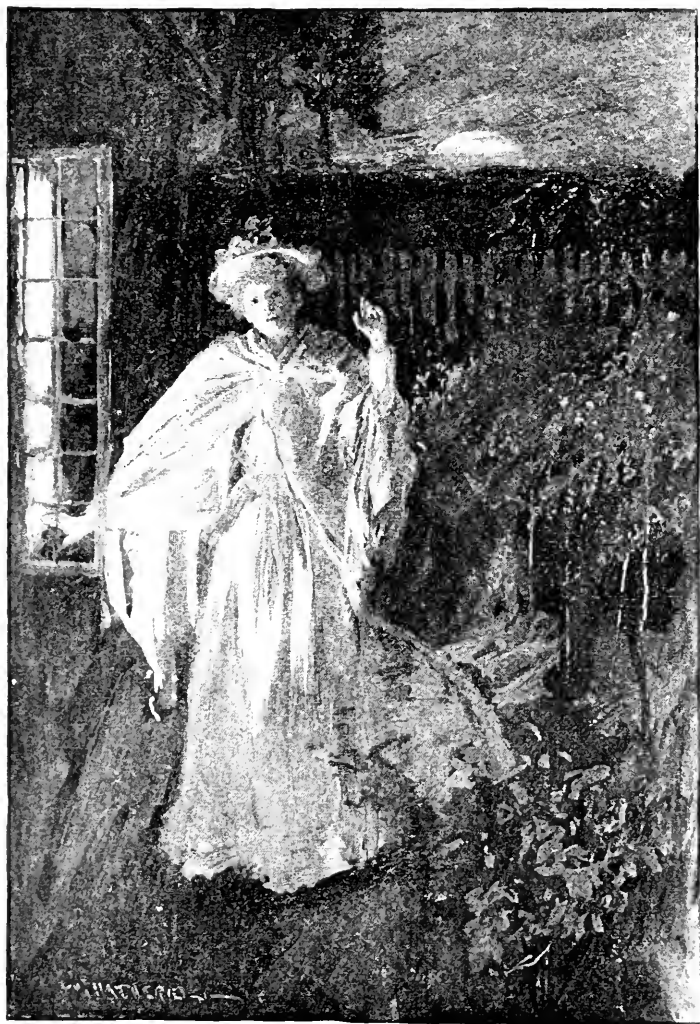
THEY SAW THE WINDOW OPEN AND A FIGURE IN A WHITE SHAWL CREEP OUT OF IT