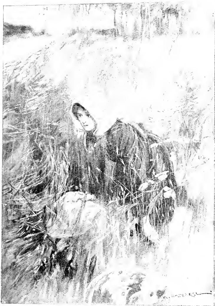
A GIRL ROSE FROM AMONG THE BROOM