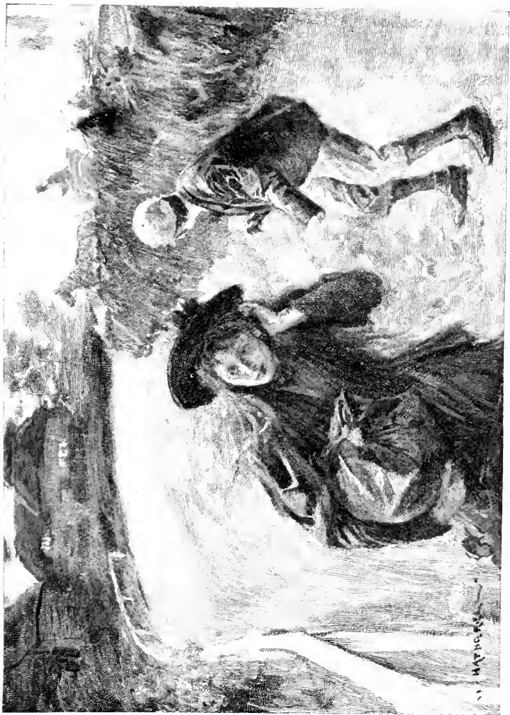
HE RAN THEM DOWN WITHIN A MILE OF TILLEDUM