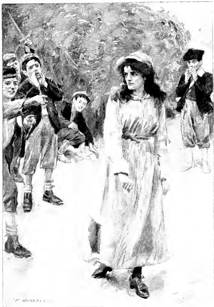
THEY WAYLAID GRIZEL WHEN SHE WAS ALONE