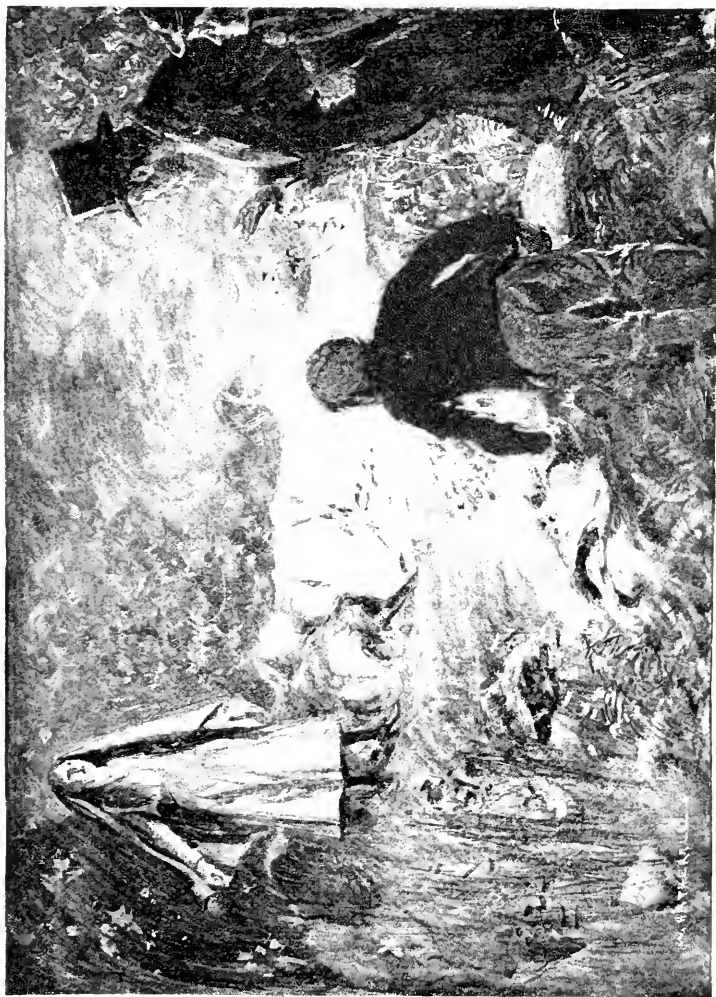
GRIZEL STOOD BY THE BODY GUARDING IT