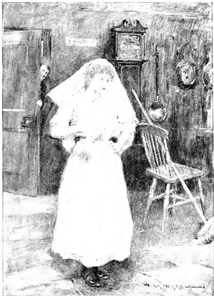
OVER HER HEAD WAS A LITTLE MUSLIN WINDOW-BLIND, REPRESENTING A BRIDE'S VEIL