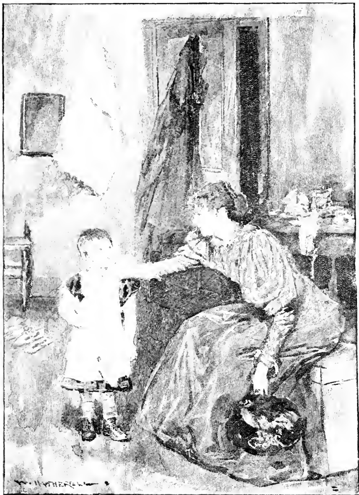
BOB FELL IN LOVE WITH HIM ON THE SPOT