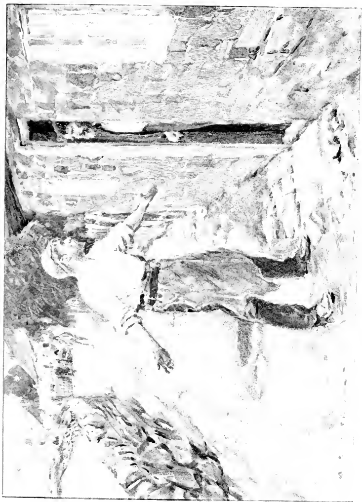
"SHE'S DYING, MAN," HE CRIED