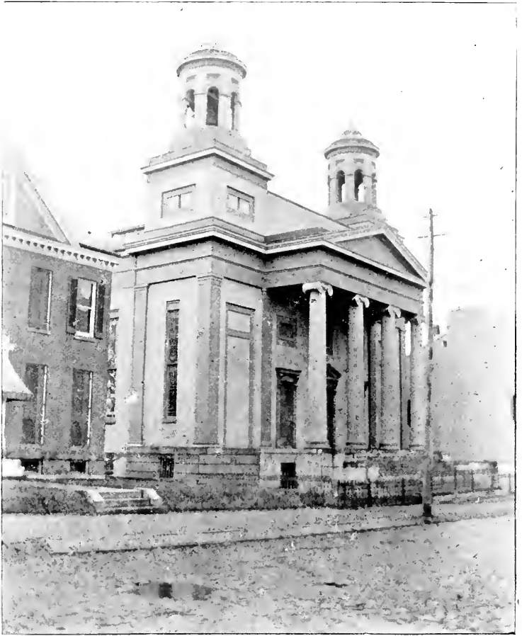
EVANGELICAL REFORMED CHURCH, FREDERICK, MD.