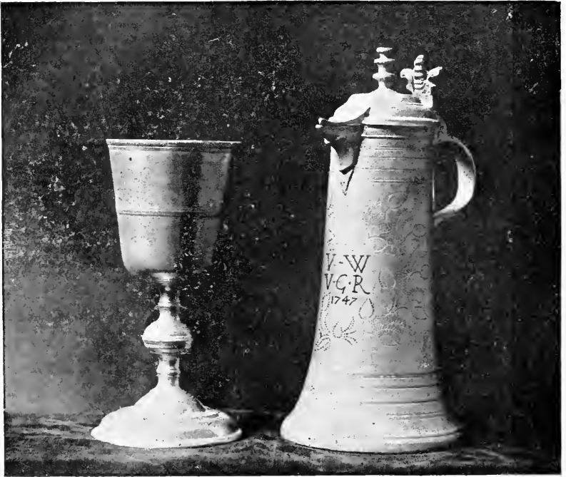
ANCIENT COMMUNION SERVICE.