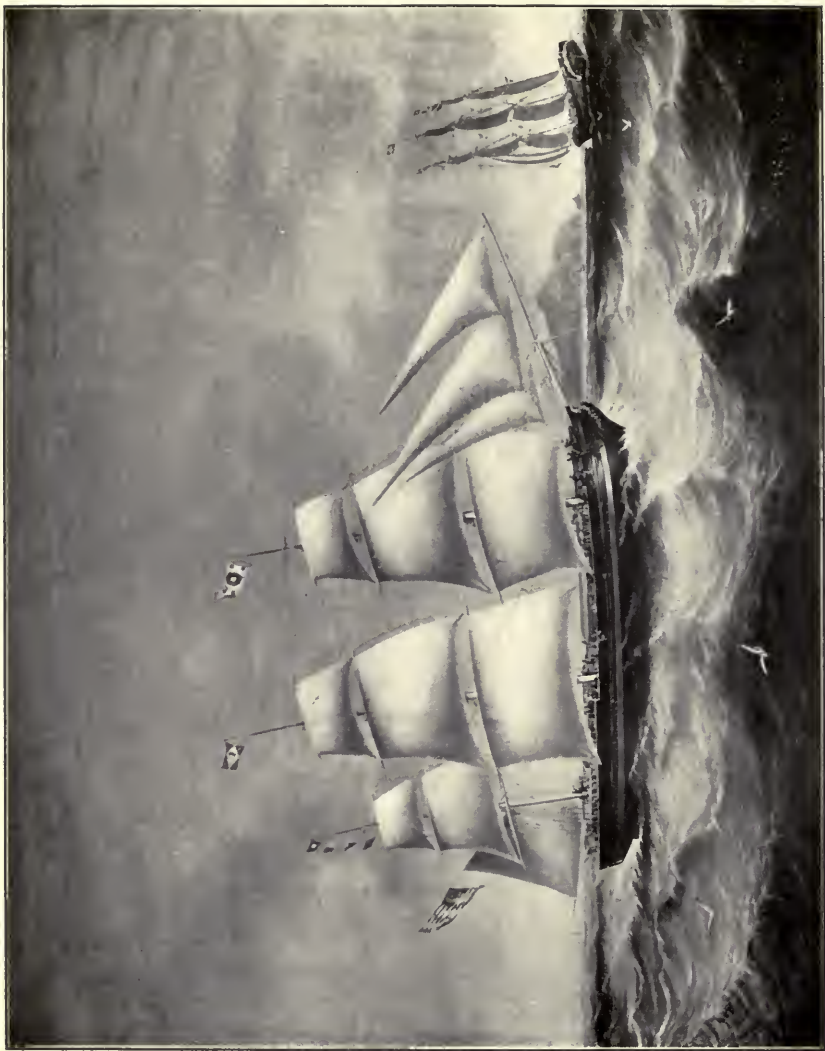
SHIP "COLUMBIANA "