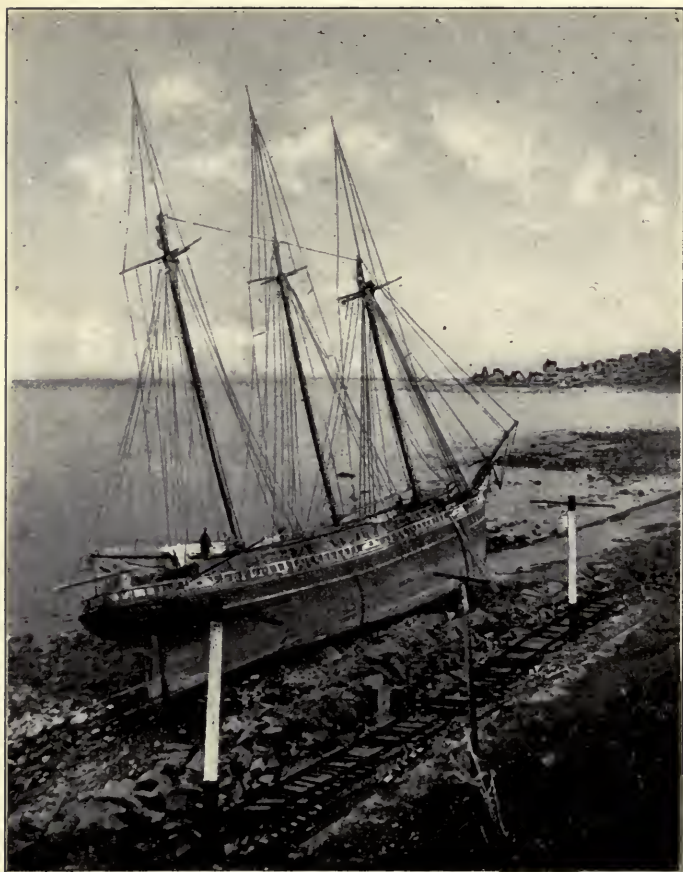
SCHOONER "HENRY R. TILTON"

On Stony Beach, Hull, after the Great Storm of November, 1898