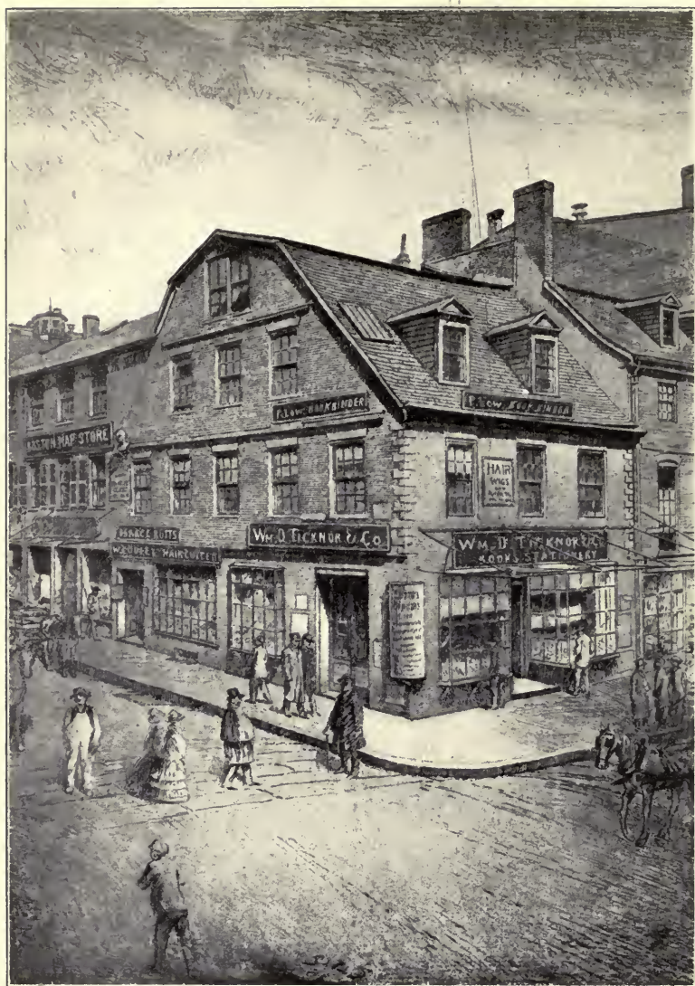
THE OLD CORNER BOOK STORE.