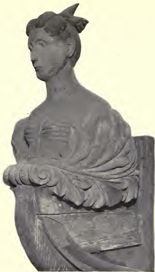
FIGUREHEAD OF THE "MARITANA."

In the Marine Museum, Boston, Mass., bearing the following legend: