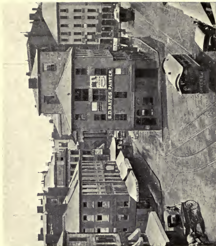
SCOLLAY SQUARE, 1860, LOOKING EAST.

Showing building formerly the New England Museum on the left