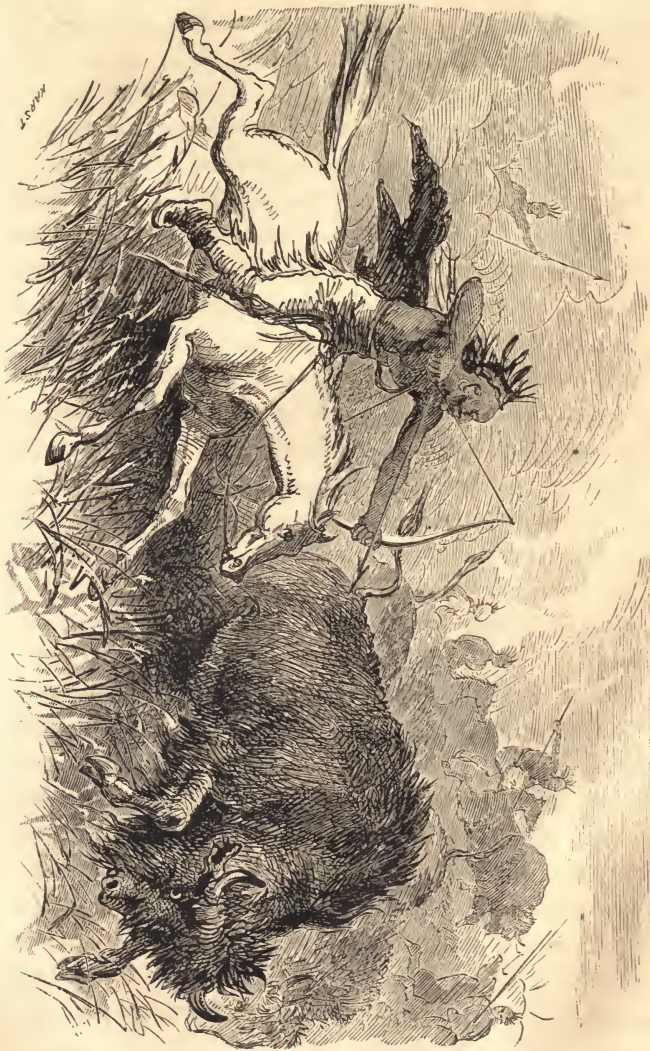
The Buffalo Hunt.