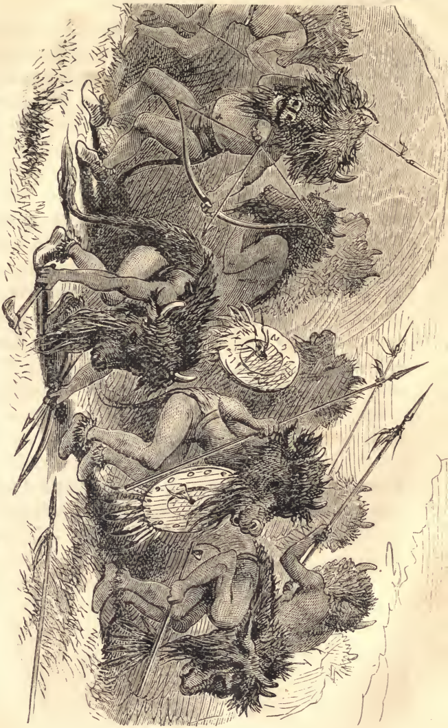
The Buffalo Dance.