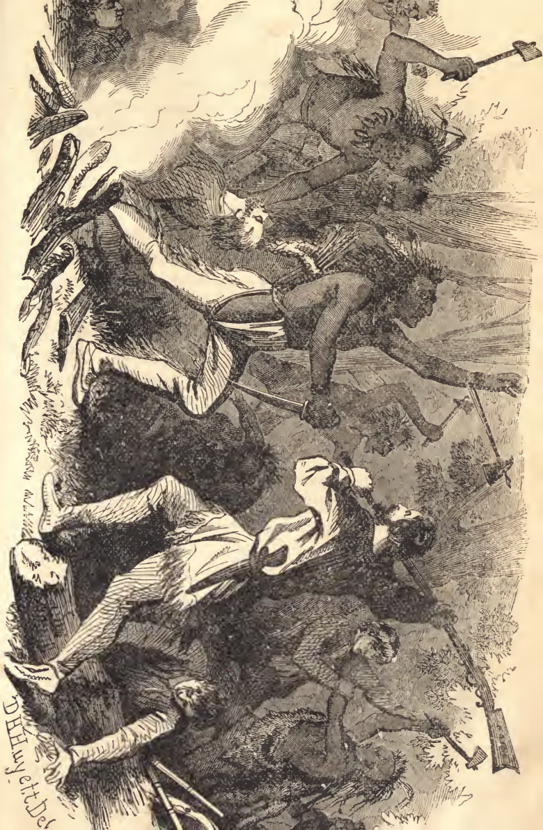
Massacre of Whites on the Western Frontier.