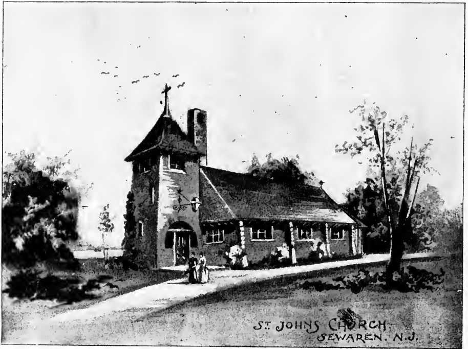
ST. JOHN'S CHURCH SEWARREN, N.J.