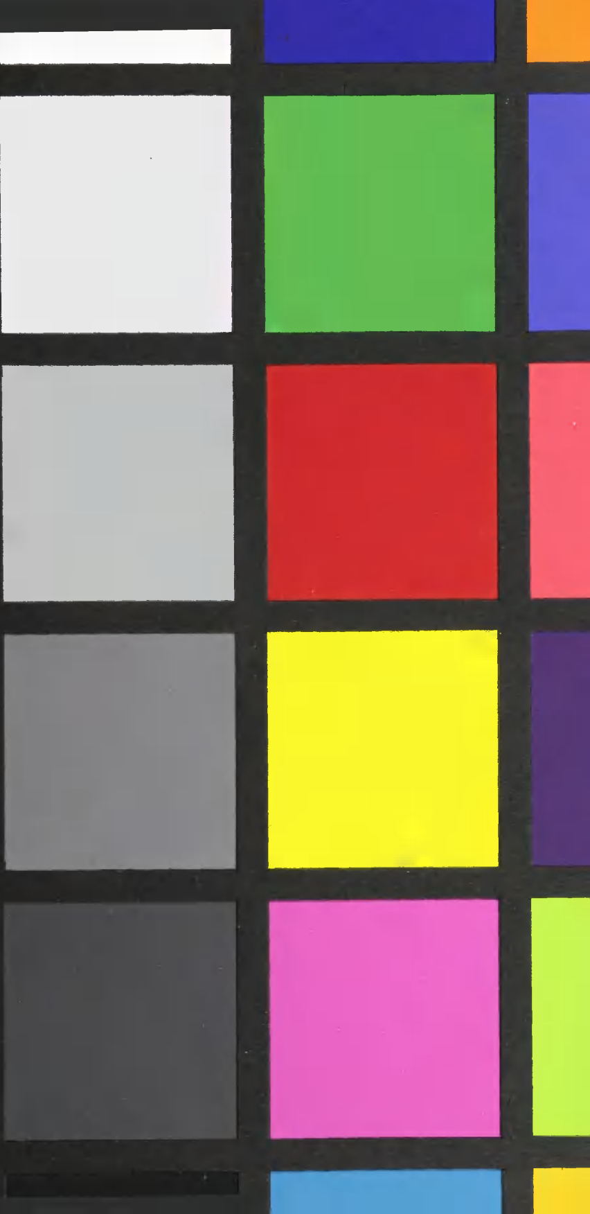
GretagMachbeth™ ColorChecker Color Rendition Chart