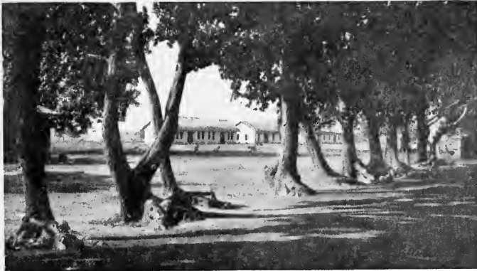
THE SAL AVENUE

After an early walk to a neighbouring village, where some of the older students conduct a night school for the boys of the Santal aboriginal tribes who are to be found scattered about in the neighborhood, I attended service in the temple, a building open to the light and air on all sides. As I entered, the boys in their coloured shawls were seated, some on the steps