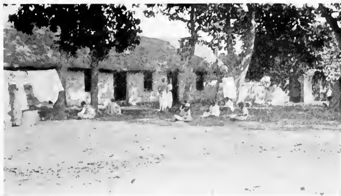
BOYS AT AN EXAMINATION