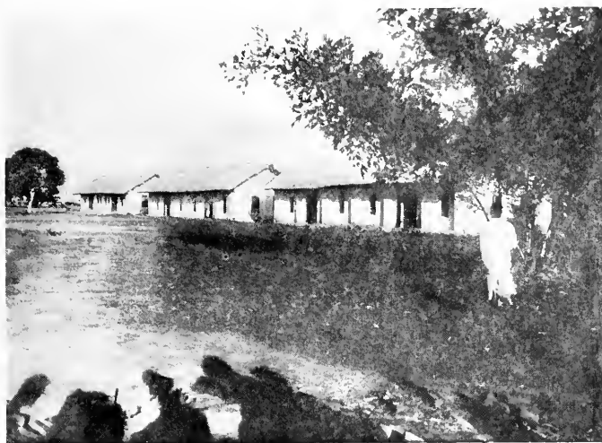
THE SMALL BOY'S DORMITORIES