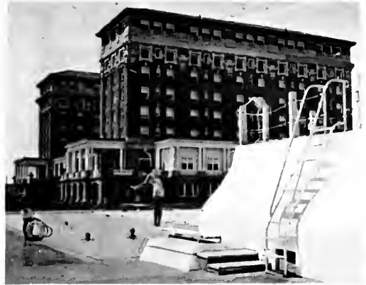
Residence for Women and Swimming Pool

Cape May is one of the most historic spots along the Atlantic coast. It is America's oldest seashore resort with the largest accumulation of Victorian architecture in the country, headquarters of America's Audubon Society, right on the Atlantic Ocean with the sun and the moon rising out of the sea and setting across the Delaware Bay. Six large city blocks at the north end of Cape May have been zoned by the city for the College and its future development. The College is within a radius of New York, Philadelphia, Baltimore, Washington, Richmond, and the historic points of early America. It is a quiet, restful, ideal place for study and for students. The College is free of hippies, yuppies, and the spirit of disobedience and riot which characterizes so many of the institutions of the day.