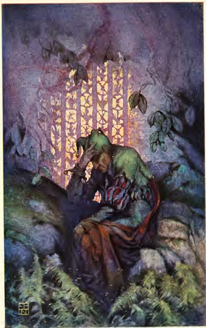
"HE CANNOT ENTER NOW. THE GATES ARE CLOSED AGAINST HIM"—Page 222