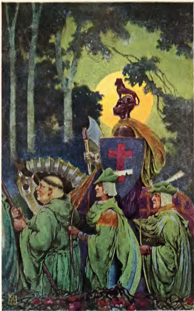
"IT WAS THE KING COME HOME FROM THE CRUSADE"—Page 133