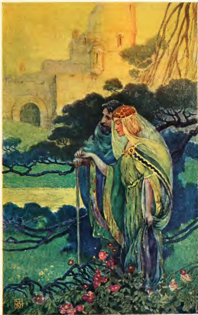
"A HAPPY BRIDEGROOM WITH THE HAPPY BRIDE"—Page 143