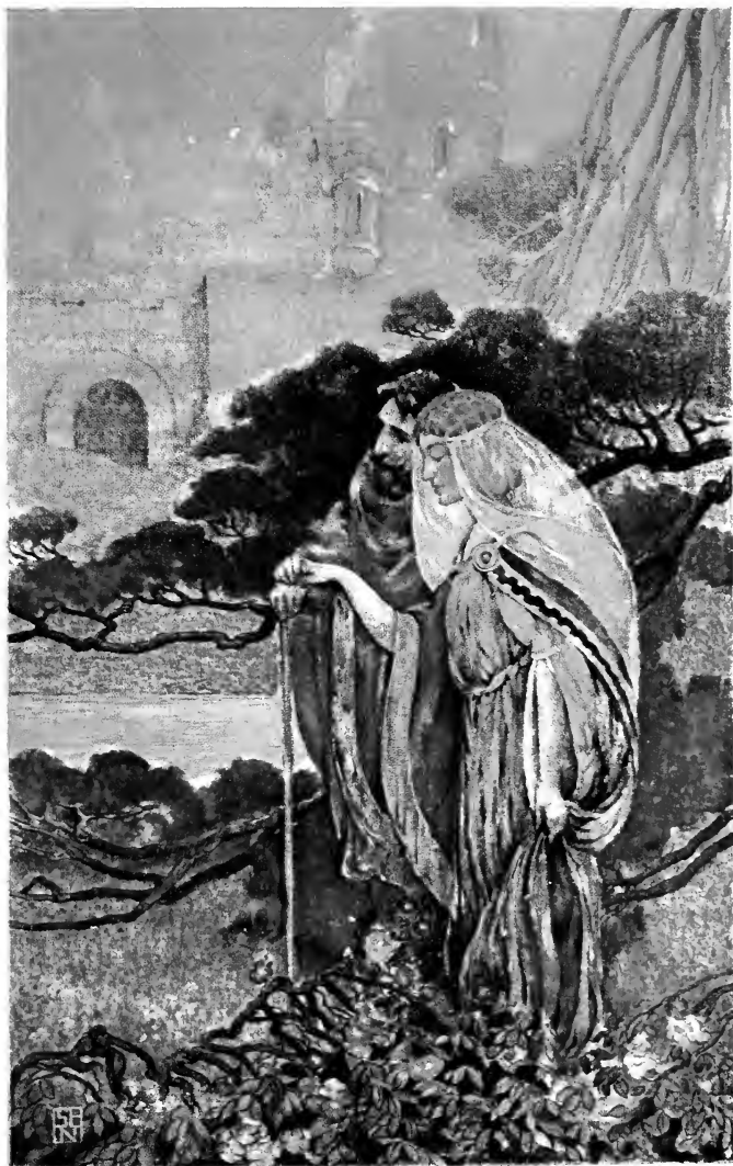
"A HAPPY BRIDEGROOM WITH THE HAPPY FIDELE" P. 100