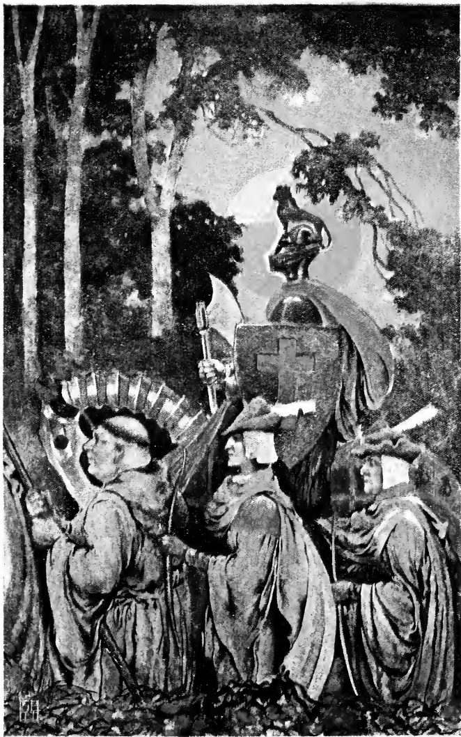
"IT WAS THE KING COME HOME FROM THE CRUSADE"—Page 133