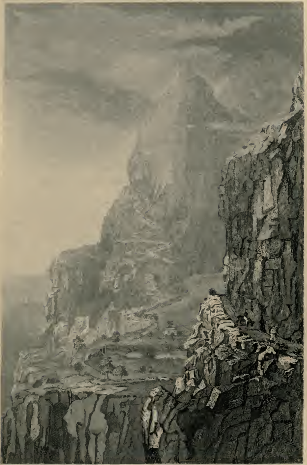
GRAND MOUNTAIN MARIETTA.