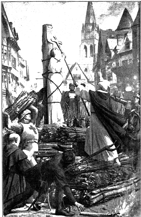
From the painting by Lenepveu.

Burning of Joan of Arc at Rouen, May 30, 1431.