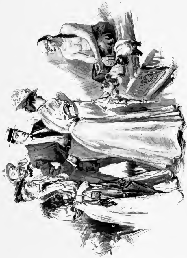
The big chap would fetch fifty to a hundred pounds in London