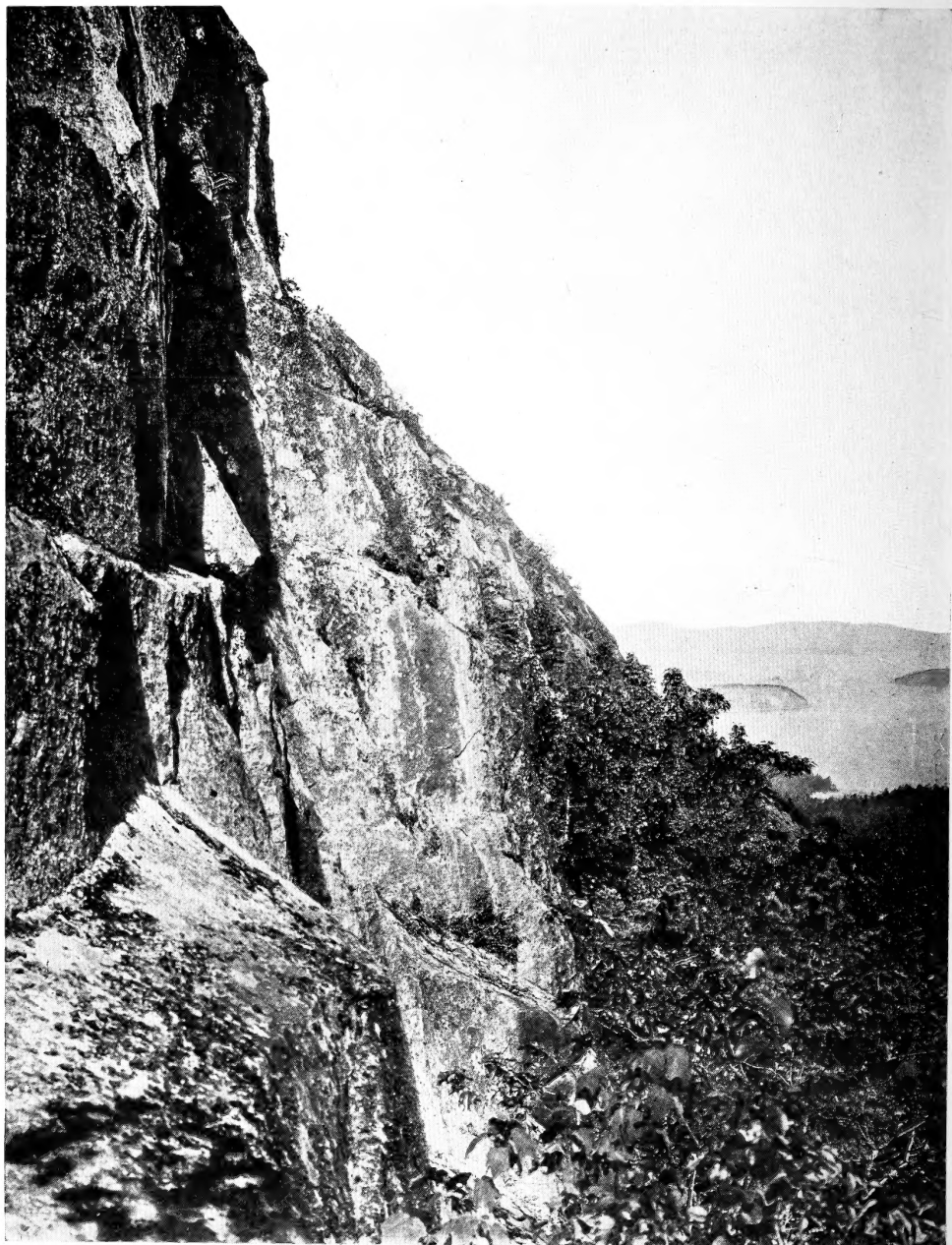
Sieur de Monts National Monument—The East Cliff